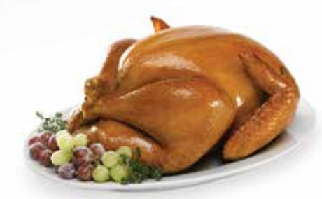
Fresh Turkey Sold by the pound (uncooked).

See a Meat Associate for available varieties including antibiotic free, organic, and more.