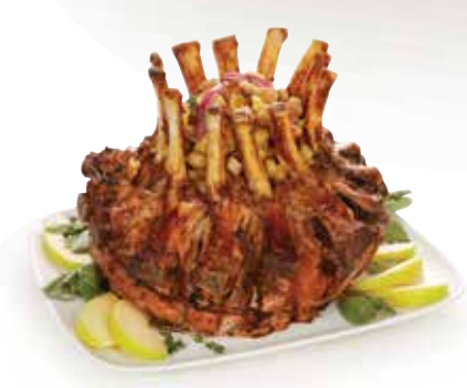
Crown Roast Pork Sold by the pound (uncooked).