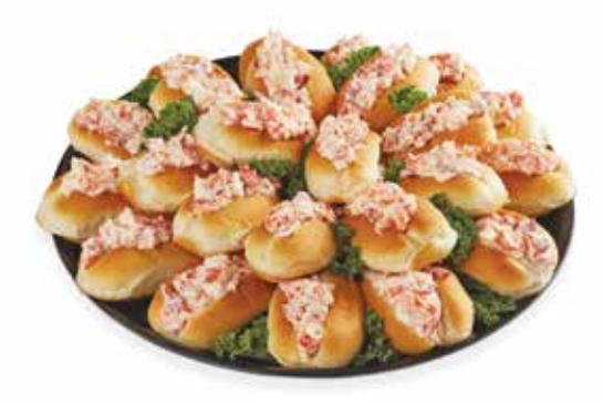
Lobster Salad Sandwich Tray

Lobster Salad Finger Roll Sandwiches. Small Serves 5–6 Large Serves 10–12 See a Deli Associate to place your order.