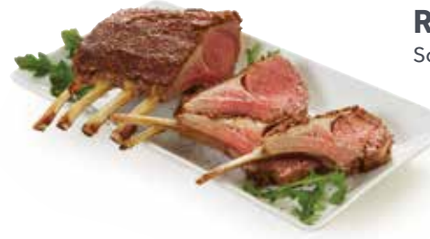
Rack of Lamb Sold by the pound (uncooked).

See a Meat Associate for available varieties including antibiotic free, organic, and more.