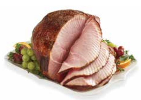
Spiral Sliced Ham

Sold by the pound. (Fully cooked, heat and serve).