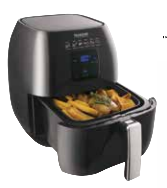
nuwave 8999 Reg. 94<sup>99</sup> BRIO 3 QT AIR FRYER