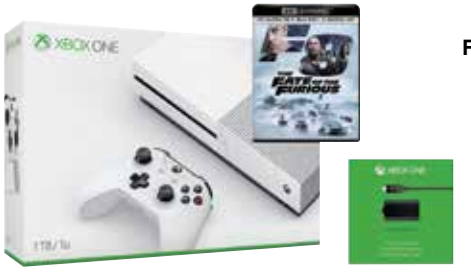
FREE with Purchase, Must Choose One