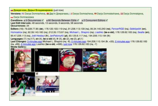
Figure 1: Screenshot of an extended version of Wikipedia Live Monitor running Social Media Illustrator on the server-side with a generated media gallery in HTML format for Darya Domracheva, Women's Boathlon Pursuit event Olympic gold medal winner

On the server-side, we use a library called node-canvas [8] that implements the HTML5 canvas API [5] on the server. This library allowed us to port the original client-side code used in Social Media Illustrator with manageable effort to the server. The canvas