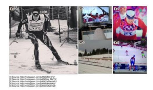
Figure 2: Static dump of a media gallery of kind Loose Order, Varying Size for Dario Cologna, Men's Skiathlon event Olympic gold medal winner