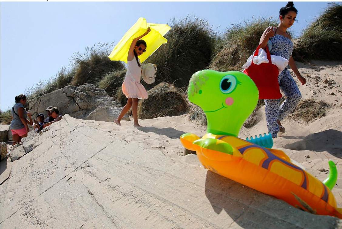
Children walk over the remains of a concrete wall on the former Utah Beach D-Day landing zone near La Madeleine, France