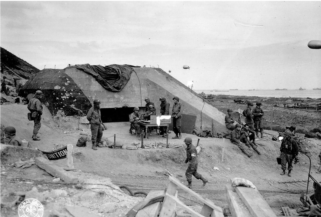
June 7, 1944: US Army troops congregate around a signal post used by engineers on the site of a captured German bunker overlooking Omaha Beach after the D-Day landings near Saint Laurent sur Mer