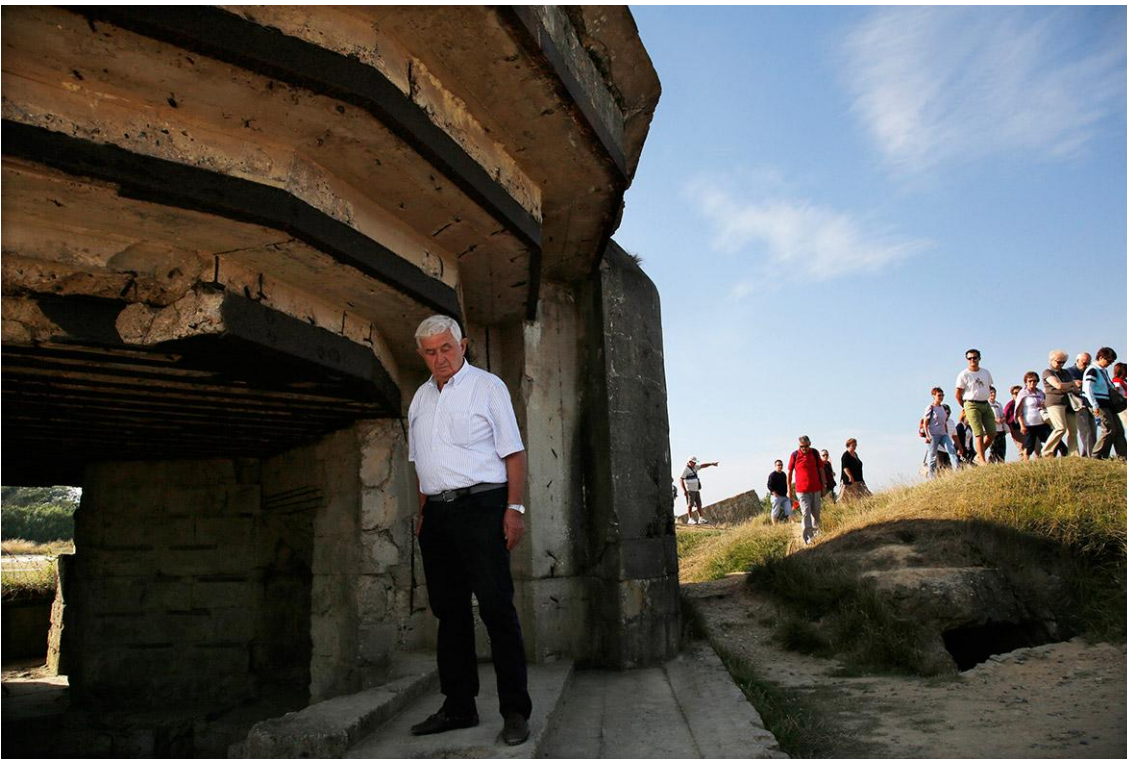
An Italian tourist views a bunker at a strategic site overlooking the D-Day beaches which had been captured by US Army Rangers at Pointe du Hoc, France