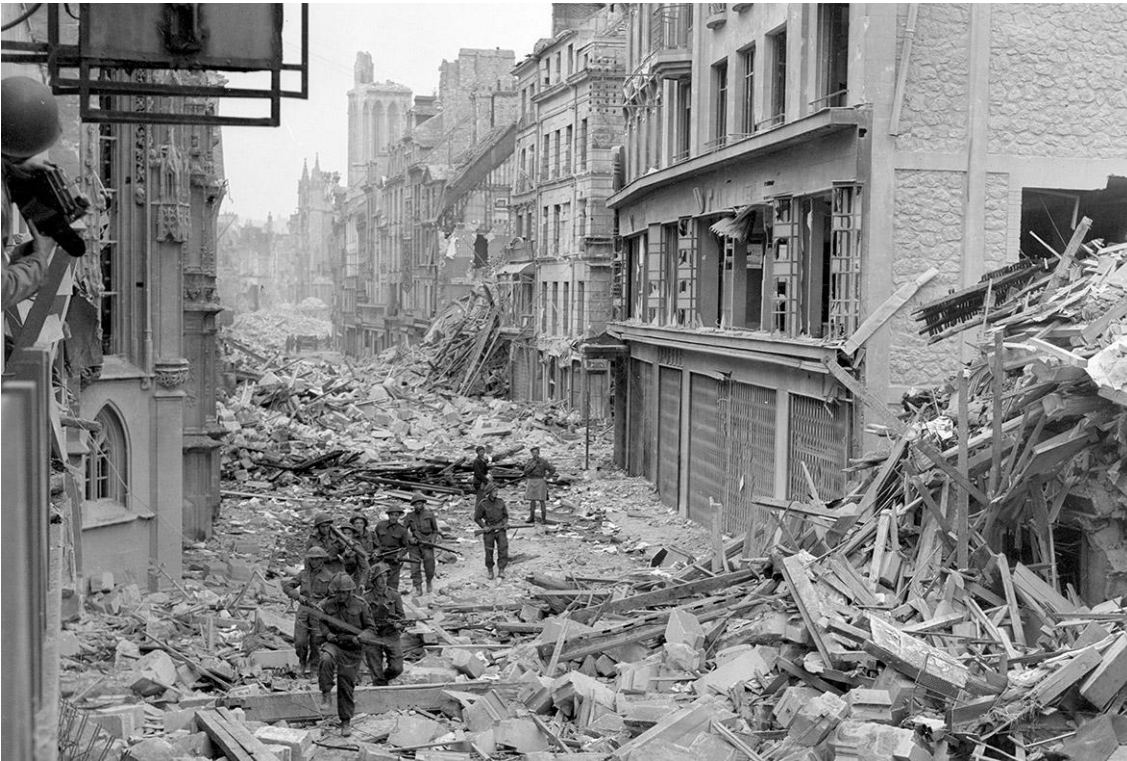
July 1944: Canadian troops patrol along the destroyed Rue Saint-Pierre after German forces were dislodged from Caen