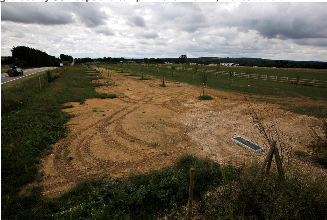
A farm field remains where German prisoners of war were interned following the D-Day landings in Nonant-le-Pin, Normandy