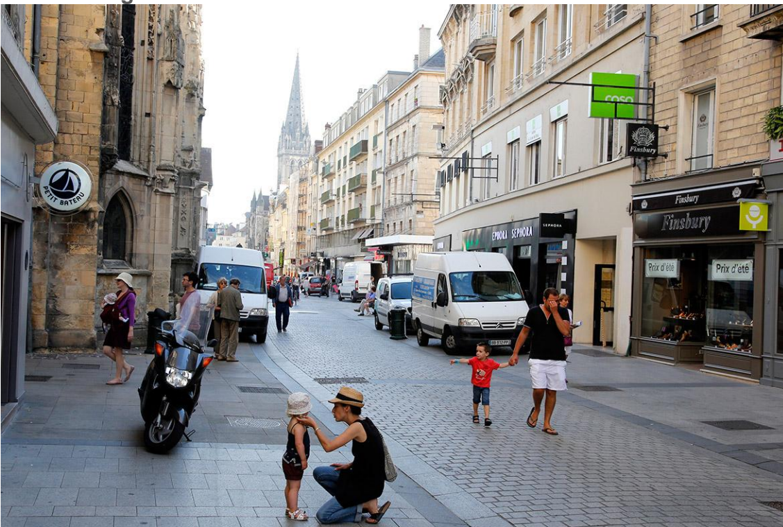
Shoppers walk along the rebuilt Rue Saint-Pierre in Caen, which was destroyed following the D-Day landings