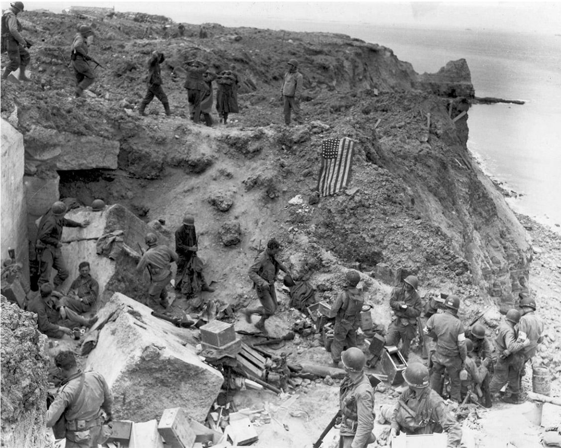
June 8, 1944: A US flag lies as a marker on a destroyed bunker two days after the strategic site overlooking D-Day beaches was captured by US Army Rangers at Pointe du Hoc, France