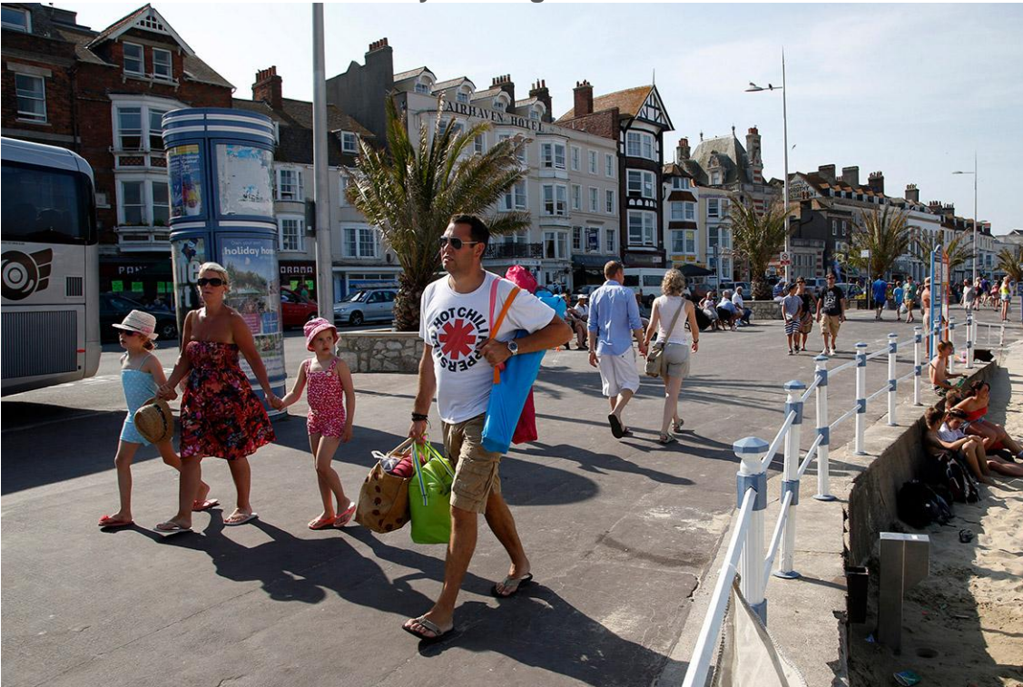
Tourists walk along the beach-front in the Dorset holiday town of Weymouth. The port was the departure point for thousands of Allied troops who took part in the D-Day landings