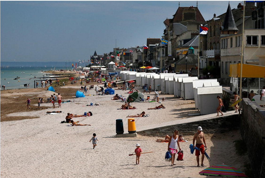
Tourists enjoy the sunshine on the former Juno Beach D-Day landing zone, where Canadian forces came ashore, in Saint-Aubin-sur-Mer, France