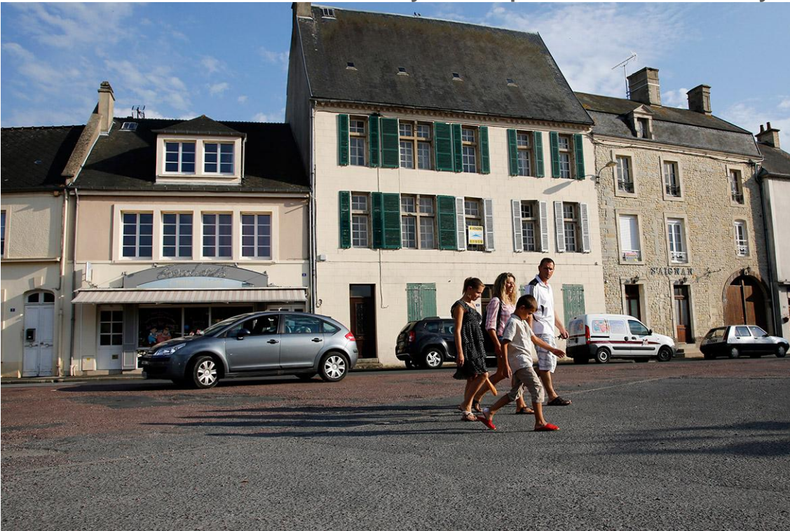
Tourists walk across the main square of Place Du Marche in Trevieres, near the former D-Day landing zone of Omaha Beach