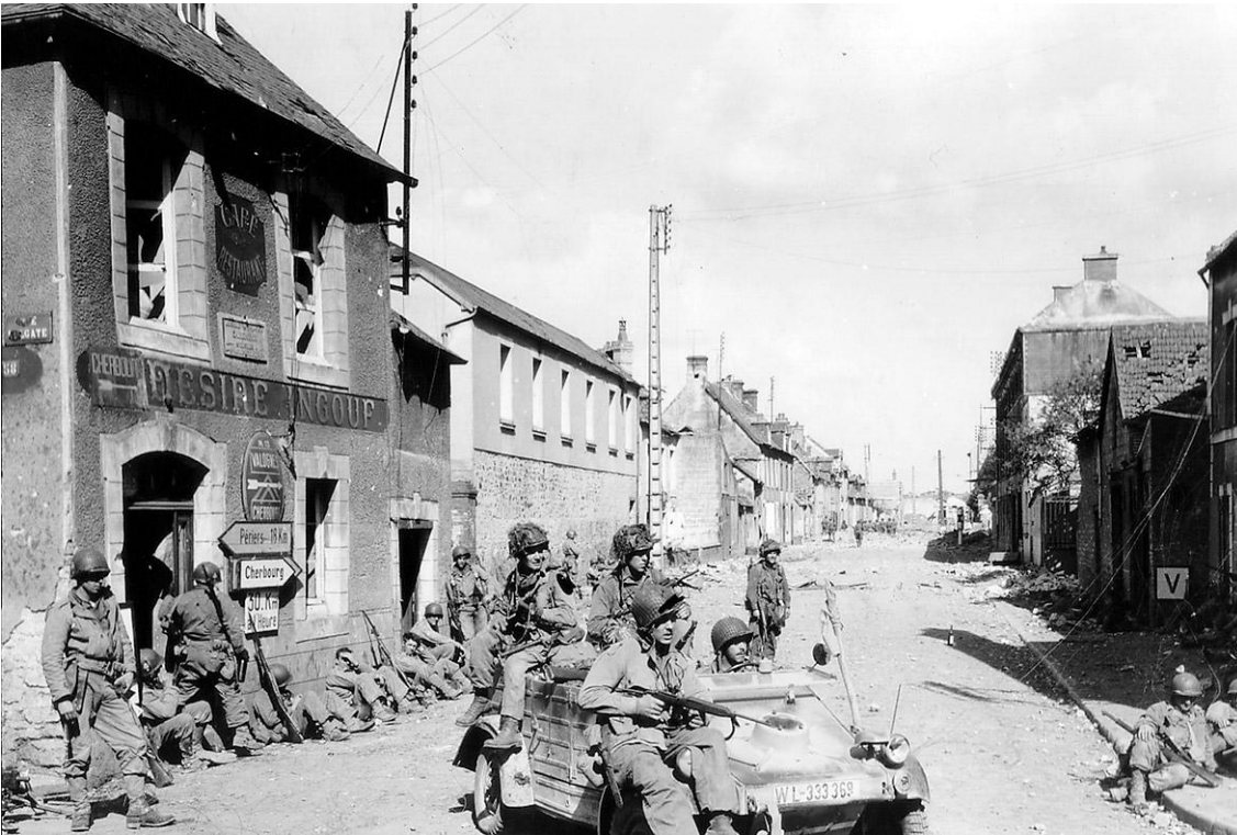
June 6, 1944: US Army paratroopers of the 101st Airborne Division drive a captured German Kubelwagen at the junction of Rue Holgate and RN13 in Carentan, France