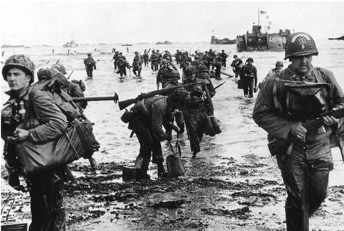
June 6, 1944: US reinforcements land on Omaha beach during the Normandy D-Day landings near Vierville sur Mer, France