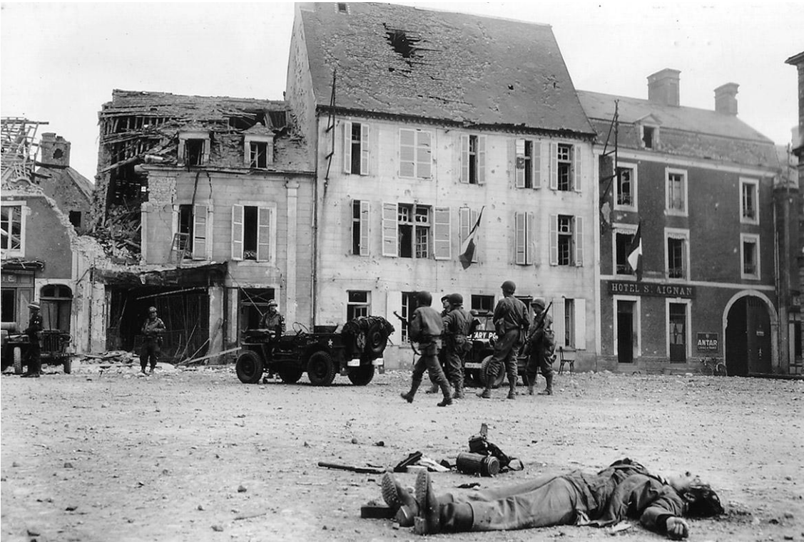
June 15, 1944: The body of a dead German soldier lies in the main square of Place Du Marche in Trevieres after the town was taken by US troops who landed at nearby Omaha Beach