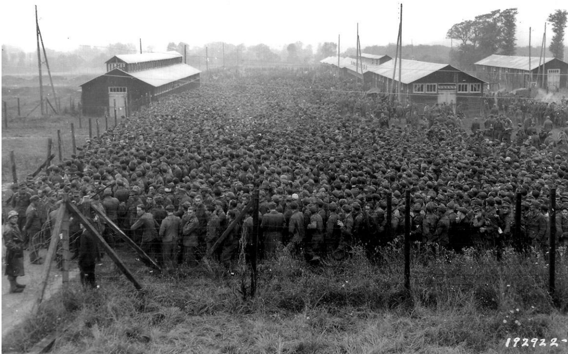
August 21, 1944: German prisoners of war captured after the D-Day landings in Normandy are guarded by US troops at a camp in Nonant-le-Pin, France