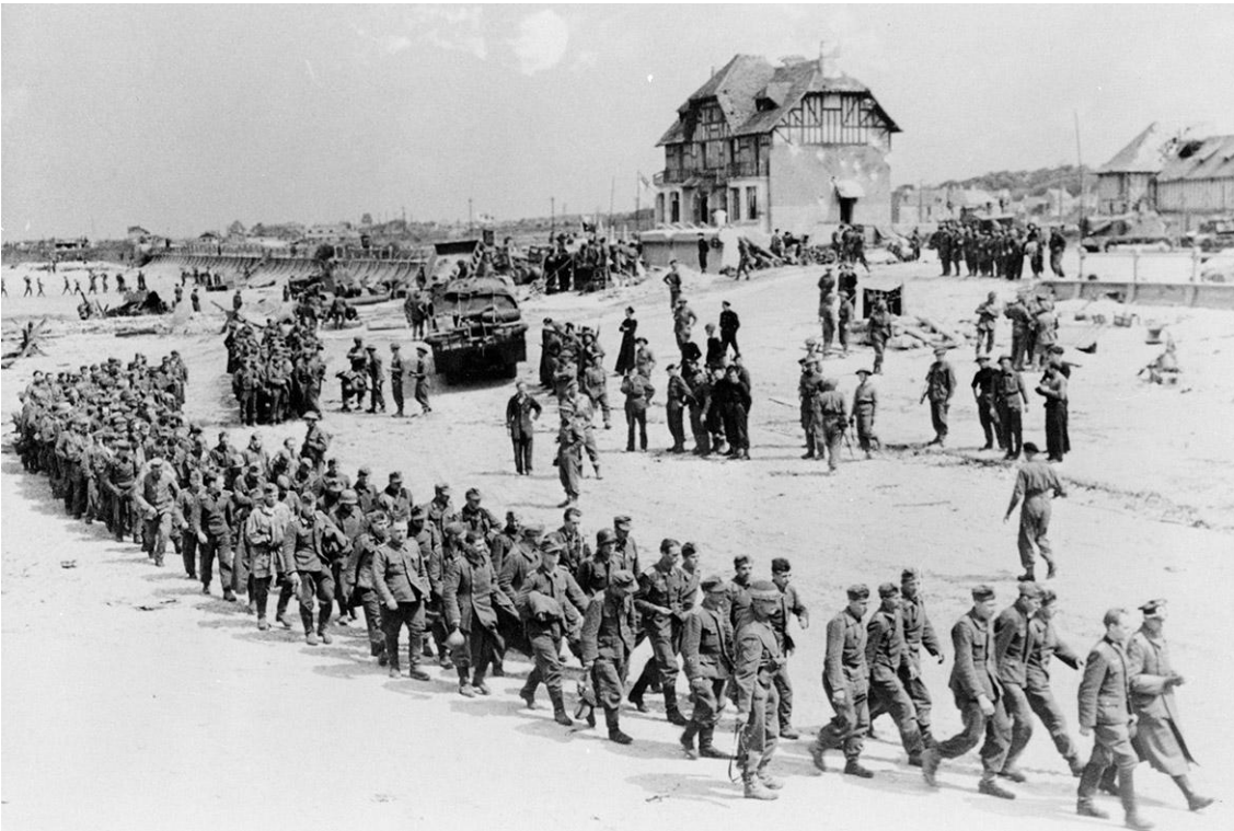
June 6, 1944: German prisoners-of-war march along Juno Beach landing area to a ship taking them to England, after they were captured by Canadian troops at Bernieres Sur Mer, France