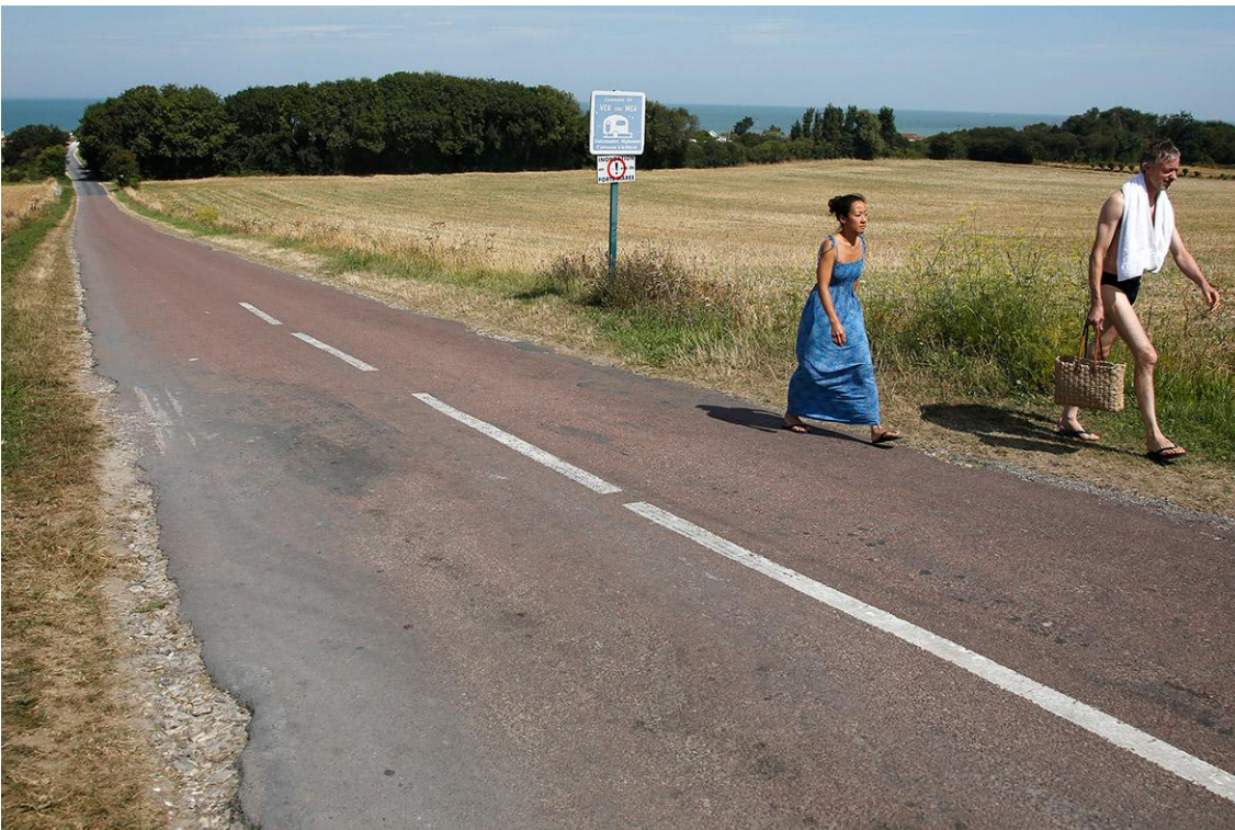
A couple walk inland from the former D-Day landing zone of Gold Beach where British forces came ashore in 1944, in Ver-sur-Mer, France