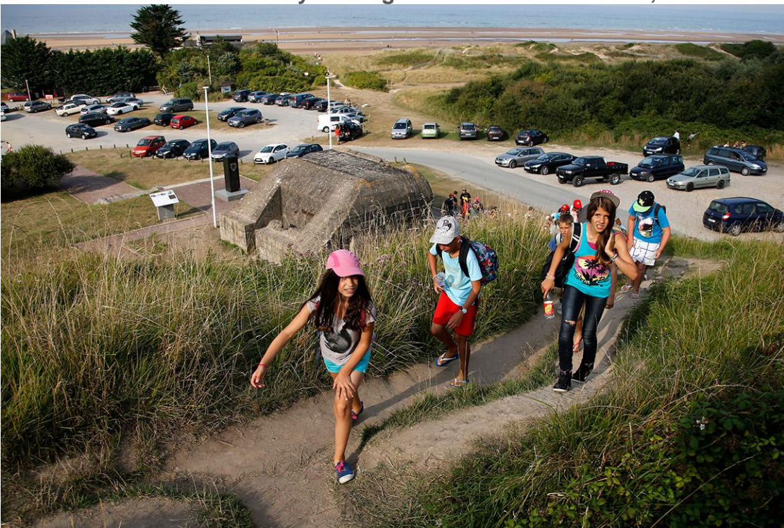
Youths hike up a hill past an old German bunker overlooking the former D-Day landing zone of Omaha Beach near Colleville sur Mer, France