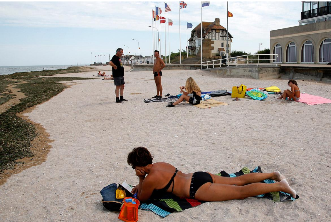
A tourist sunbathes on a former Juno Beach landing area where Canadian troops came ashore on D-Day at Bernieres Sur Mer, France