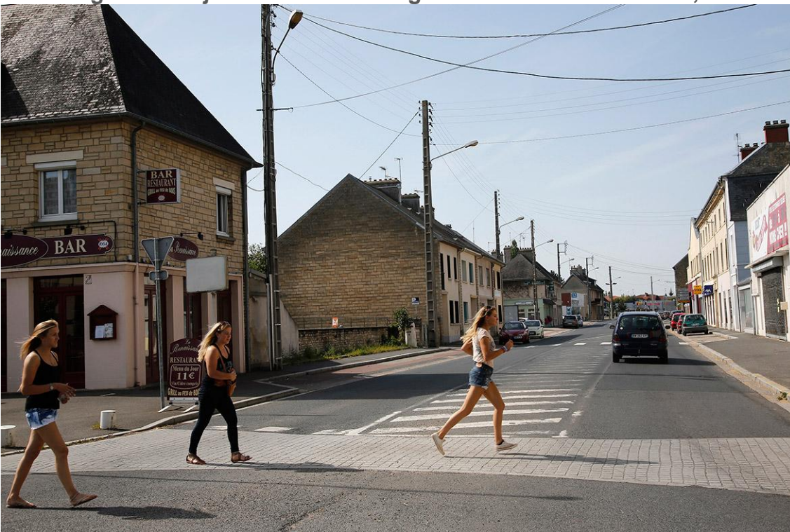
Girls run across the street at the junction of Rue Holgate and RN13 in the Normandy town of Carentan, France