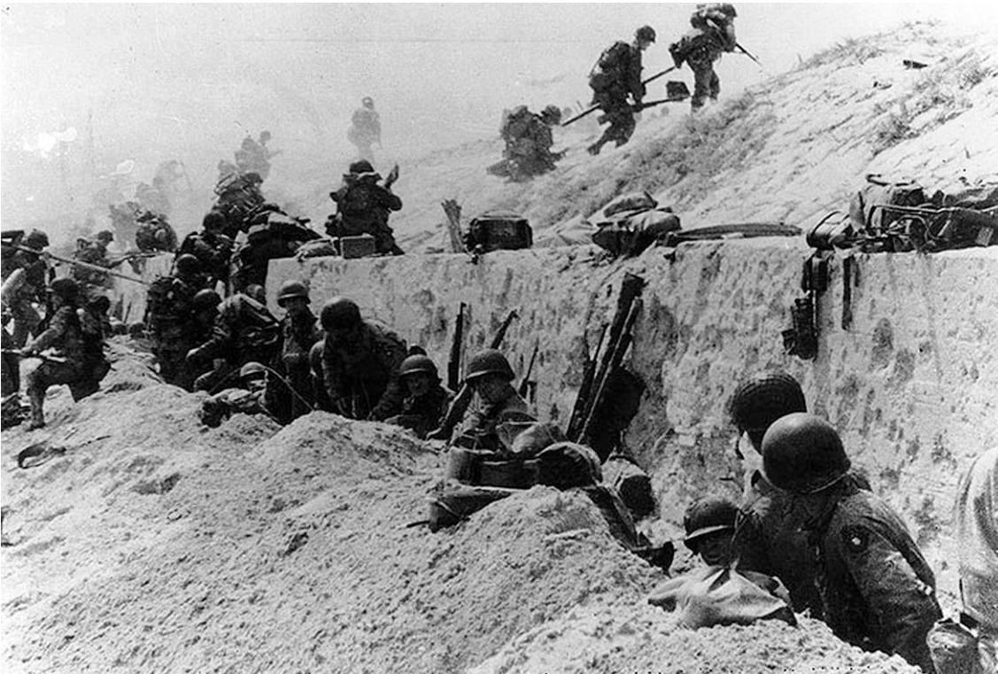
June 6, 1944: US Army soldiers of the 8th Infantry Regiment, 4th Infantry Division, move out over the seawall on Utah Beach after coming ashore in front of a concrete wall near La Madeleine, France