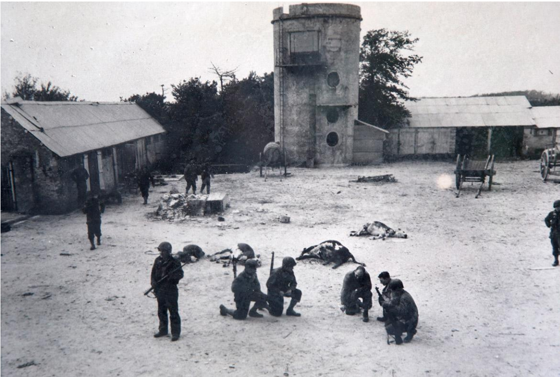
June 6, 1944: US Army troops make a battle plan in a farmyard amid cattle, killed by artillery bursts, near the D-Day landing zone of Utah Beach in Les Dunes de Varreville, France