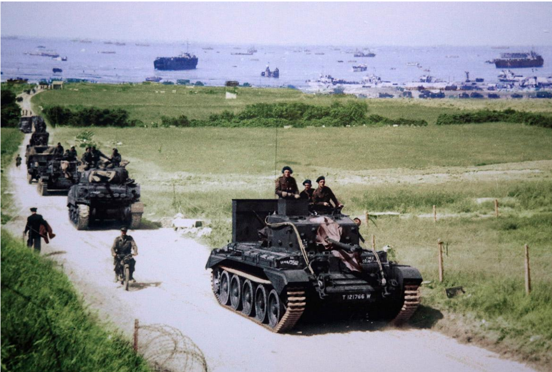
June 6, 1944: A Cromwell tank leads a British Army column from the 4th County of London Yeomanry, 7th Armoured Division, after landing on Gold Beach on D-Day in Ver-sur-Mer, France