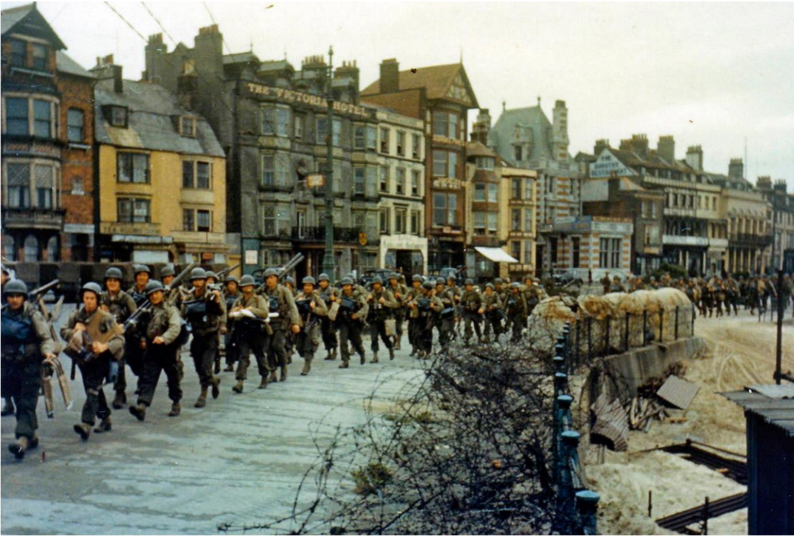
June 5, 1944: The 2nd Battalion US Army Rangers march to their landing craft in Weymouth, England. They were tasked with capturing the German heavy coastal defence battery at Pointe du Hoc to the west of the D-Day landing zone of Omaha Beach