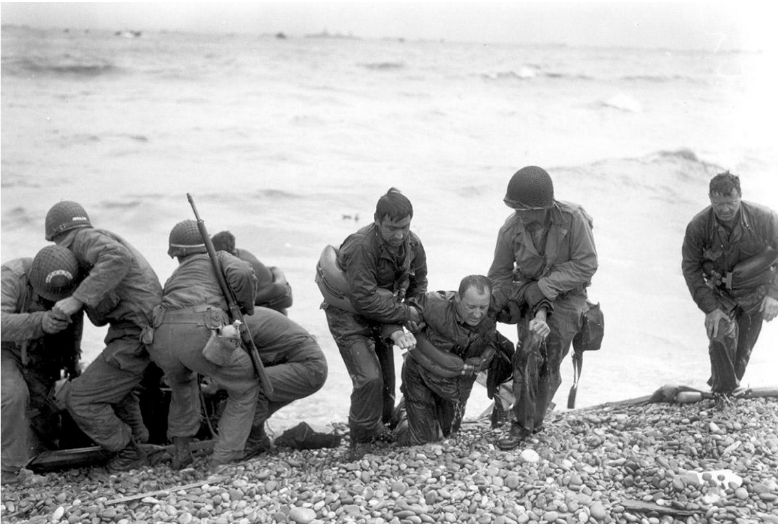
June 6, 1944: Members of an American landing party assist troops whose landing craft was sunk by enemy fire off Omaha beach, near Colleville sur Mer, France Reuters