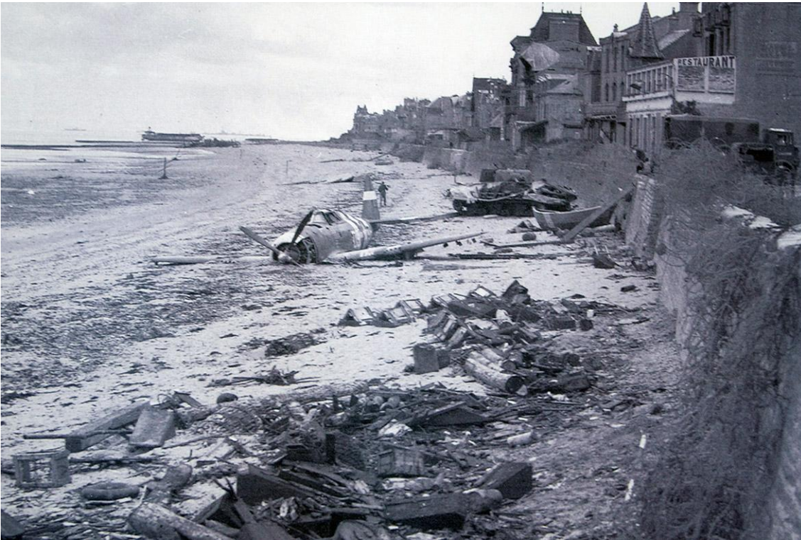
June 1944: A crashed US fighter plane is seen on the waterfront some time after Canadian forces came ashore on a Juno Beach D-Day landing zone in Saint-Aubin-sur-Mer, France