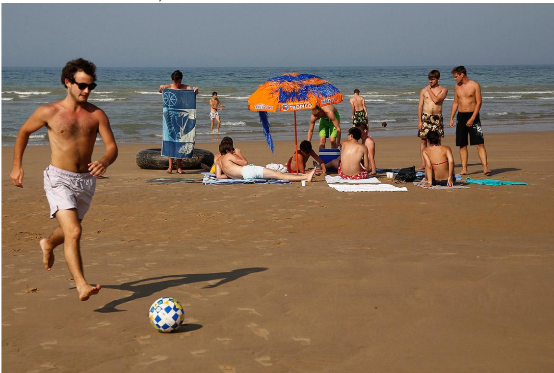
Holidaymakers enjoy the sunshine on the former D-Day landing zone of Omaha beach near Vierville sur Mer, France