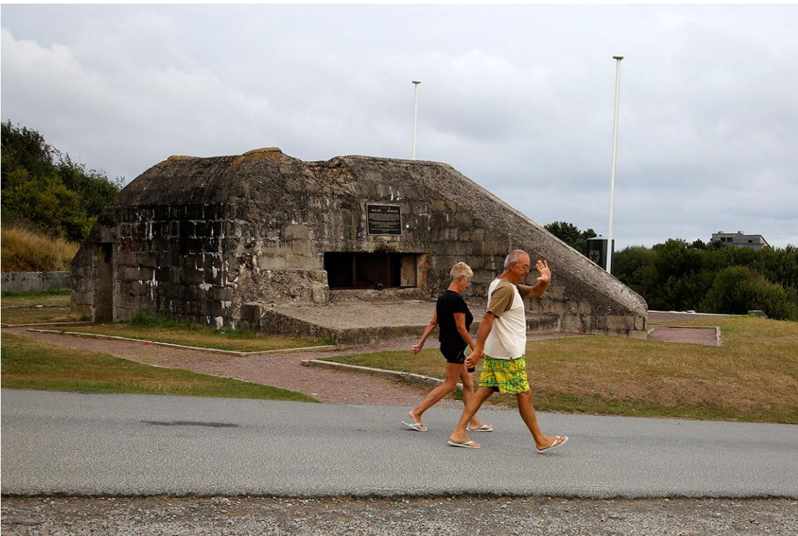
Tourists walk past a former German bunker overlooking the D-Day landing zone on Omaha Beach near Saint Laurent sur Mer, France