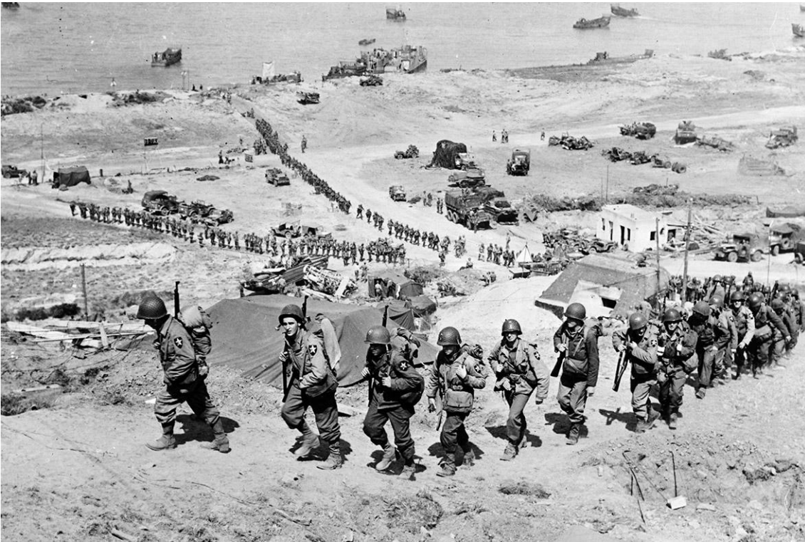
June 18, 1944: US Army reinforcements march up a hill past a German bunker overlooking Omaha Beach after the D-Day landings near Colleville sur Mer, France