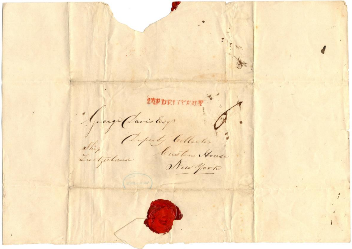
[Figure 3 – Reproduced from “Records of the Honorable and Ancient Court of Dover,” Nathan Sanford Papers SC14054, Folder 5, Manuscripts and Special Collections, New York State Library, Albany, New York]

Switzerland,” indicating that it came on a ship with that name to New York City. At any rate, here was a genuine lead, a solid name and a location.