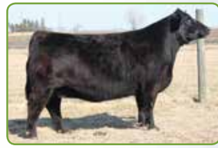
HILB Fairy Tale B5 Grandam