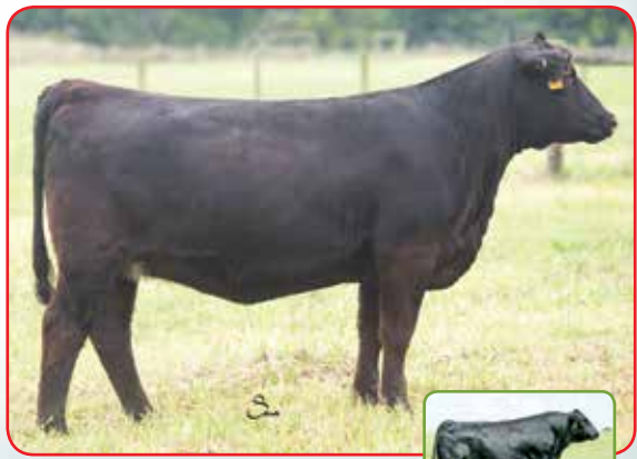
SS Goldmine L42 A.I. Sire

A.I. Sire: SS Goldmine L42 on 5-7-19 • Due: 2-13-20 Est. Plan Mating EPDs: 8 .6 58 82 .15 3 25 54 16 11.95 Carcass #: 12.25 -.39 .05 -.10 .46 107 60 Pasture Sire: Harkers Jackson F212 from 5-30 to 8-21-19