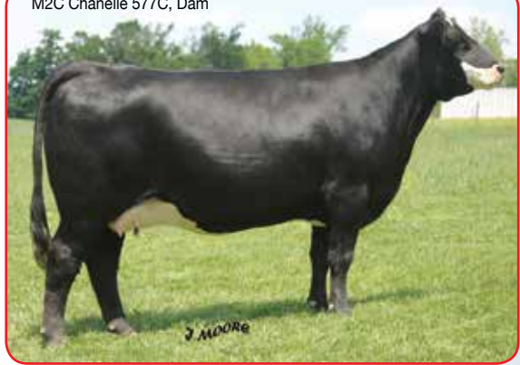
M2C Channelle 577C, Dam

A.I. Sire: RFG/K-LER Elevation 727E on 4-3-19 • Sexed Heifer • Safe • Due: 1-10-20 Est. Plan Mating EPDs: 10 1.3 65 96 .20 5 23 55 17 4.85 Carcass #: 13.75 -.37 .09 -.08 .57 127 69 Pasture Sire: AKRG Flash 701E from 5-9 to 8-1-19