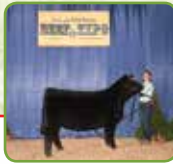
Besh Ms. Soda E27 Full Sibling