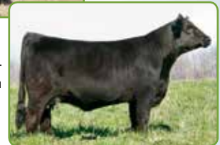
Miss Knockout 74T Dam