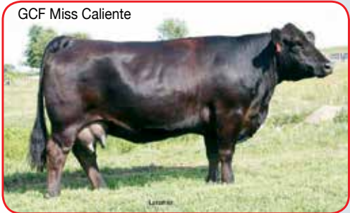
GCF Miss Caliente

H2O's Farm • Here you go people, this extremely nice, big footed, good milking momma recip cow will be laying down a GCF Miss Caliente x STF Dominance heifer calf that is due February 1, 2020. That is correct, a full sibling to STF Onyx! Look at page 32 of the July/August Register to see where Caliente and Onyx rank in the Most Prolific Simmental Cows.