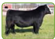
HILB Oracle C033R A.I. Sire

Hoffman Farms - Donor cow in the making. Finesse comes from a royal pedigree with the perfect blend of calving ease and maternal along with power, growth, and carcass. Finesse is a beautiful baldy female straight out of the keeper pen. She is a moderate framed, free moving female with loads of body and center mass. We are committed to bringing this type of female and are proud to be a part of the Field of Dreams Sale. Finesse is sired by the popular Hooks Bounty and stems from the immortal Ebonys Joy L123 on the bottom side. She sells Safe Al'ed to sexed HILB Oracle semen. Her heifer calf should be an exciting one to watch