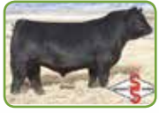
Koch Big Timber 685D A.I. Sire

A.I. Sire: Koch Big Timber 685D on 4-12-19 • Safe • Due 1-19-20 Est. Plan Mating EPDs: 15 -1.95 67 100 .21 9 27 60 17 11.25 Carcass #: 25.65 -.35 .19 -.08 .68 144 78