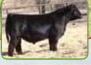
HPF Cream Soda B334, Dam W/C Double Down 5014E, A.I. Sire