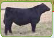
RFG/K-LER Elevation 727E A.I. Sire