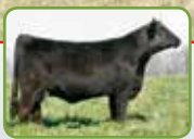
Miss Knockout 74T Grandam

A.I. Sire: Koch Big Timber 685D on 4-22-19 • Safe • Due:1-29-20 Est. Plan Mating EPDs: 13 -.1 68 100 .20 8 23 57 17 11.45 Carcass #: 26.0 -.32 .19 -.08 .60 138 75