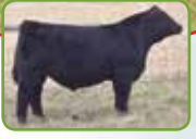
RFG/K-LER Elevation 727E A.I. Sire

A.I. Sire: RFG/K-LER Elevation 727E on 4-24-19 • Sexed Heifer • Safe • Due: 1-31-20 Est. Plan Mating EPDs: 12 .85 78 124 .29 6 24 63 15 8.8 Carcass #s: 40.0 -.21 .22 -.03 .86 127 76 Pasture Sire: AKRG Flash 701E from 5-9 to 8-1-19