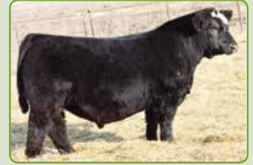
W/C Fort Knox 609F, Embryo Sire