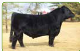
CDI Innovator 325D Sire