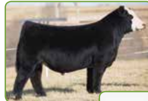
Jass On The Mark 69D Sire