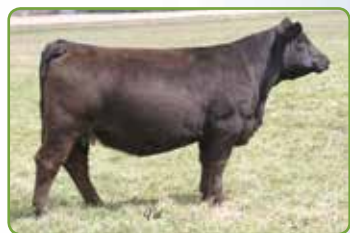
ETR/SS Gotta Love Me U311 Dam

Pedigree for Lots 12 & 12A: SVF Steel Force S701 FBFS Wheel Man 649W SVF Star Struck S199 3C Macho M450 BZ ETR/SS Gotta Love Me U311 NJC SVF Love Me Don't U