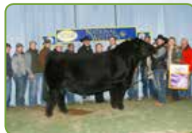
SC Pay The Price C11 Sire