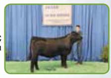
CMFM Valentine 048C Dam

Harker Simmentals - This Innovator daughter comes to you from an outstanding Icon cow that descends from the Valentine cow family. The Innovators that were exhibited at the 2019 AJSA National Classic were very well accepted and were very competitive. We are extremely excited to watch this heifer mature into an exciting show heifer and mature cow.