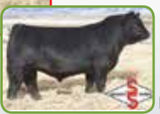
Koch Big Timber 685D, A.I. Sire