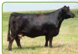
HILB Covergirl A9 Dam