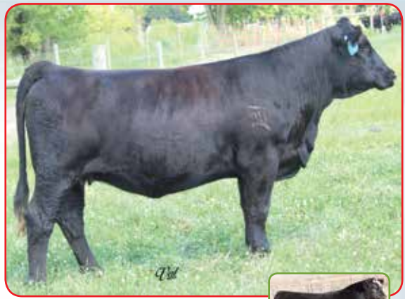
W/C Fort Knox 609F A.I. Sire