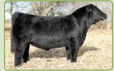
Profit, Embryo Sire