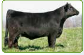
Miss Knockout 74T Grandam

Profit WS Pilgrim H182U WAGR Panarama 204Z Felt Next Big Thing 54T HF Knockout NBT 460C Miss Knockout 74T