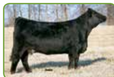
J2 Ms. Diva T04 Grandam

Beshears Simmentals • GX25 is a little greener made right now, but you really can appreciate her lines, sleek front end and depth of body. Her dam, a Diva daughter, did produce a division winner at the Hoosier Beef Congress 3 years ago. Feed her and watch her grow into a great cow.