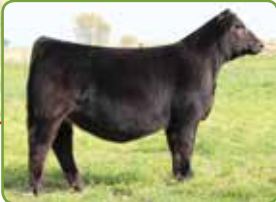
HILB/MBCC Fairy Dust Dam

Harker Simmentals • This Innovator daughter is out of an Executive Order first calf heifer that has done a terrific job of raising this complete and broody female. If you are into cattle that are hard to poke a hole in, make sure you look Angel up on sale day. She is an outstanding prospect.