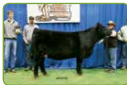
Besh Ethel W24 Dam

TJ Main Event 503B CDI Innovator 325D CDI Ms. Shear Force 49U Beshears True Man T7 Besh Ethel W24 Beshears New Years Eve