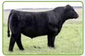
SFG The Judge D633, A.I. Sire