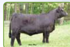
Heges Adele Dam