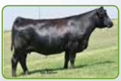
RDDS Ms. Dream On 844U Dam

Hoffman Farms • 305F is a 3/4 blood Fall heifer prospect for the SimAngus™ division. 305F is a daughter of our 844U donor and the rising star Load Limit. She is a soft centered, big hipped, functional female that is easy to work with. She is the kind that after her show career is over she will be a cow that will perform like they should; easy doing, easy keeping and problem free.