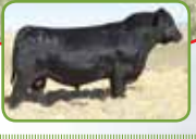
Tehama Tahoe B767 A.I. Sire

A.I. Sire: Tehama Tahoe B767 on 4-24-19 • Sexed Heifer • Safe • Due: 1-31-20 Est. Plan Mating EPDs: 17 -.85 65 99 .22 7 24 56 16 11.9 Carcass #s: 33.55 -.17 .41 -.03 .64 143 76