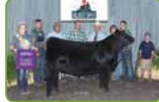
Nabe Lucy D230 Dam

S D S Graduate 006X CCR Wide Range 9005A CCR Ms. Apple 9332W Mr. HOC Broker Nabe Lucy D230 J&C/SS Bernadette