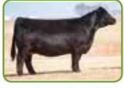
JS Flatout Flirty 46T Grandam

Harker Simmentals - Galaxy Star is a very intriguing built mid-January female. She comes to you from the same cow family the famous triple crown winner, Boots, that was shown by the Bloomberg and Griswold families a few years ago. I love the rib shape of this heifer. She powers up very nicely from behind. If you want one that's built for the long haul, look her up on sale day.