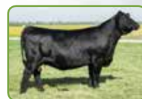
SOSF Ebony's Black Silk Dam

TJ Main Event 503B CDI Innovator 325D CDI Ms. Shear Force 49U CNS Dream On L186 SOSF Ebony's Black Silk SOSF Ebony's Joy L-123