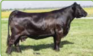
Triple C Miss Wisconsin Dam