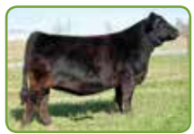
WHF Barbie 35B, Dam

MCM Top Grade O18X Hook's Bounty 6B Hook's Yuma 49Y TNT Dynasty Z226 WHF Barbie 35B WHF Trudy 35Y