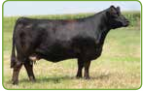
HILB Covergirl A9 Dam

Harker Simmentals - Here is a star headed beauty from a time tested and proven Uprising X Covergirl mating. This beauty will grab your attention with your eye appeal and overall balance. Females like Gee Whiz never go out of style.