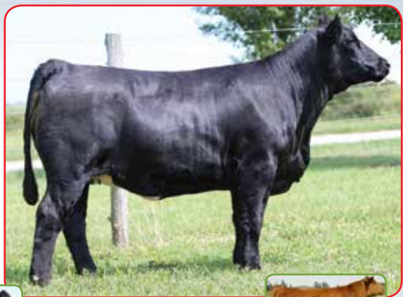
Louken Kenya 510PP Dam