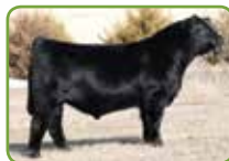
W/C Relentless 32C Sire

Hobbs Farms • This Relentless daughter is a unique individual. She's powerfully made, bold ribbed and flat shouldered. This one moves really well and is picture perfect as you view her from the side. Add in the fact her dam is the legendary 74T and you have the makings of a great one. Whether you decide to show this one or just leave the halter off and make her a donor, she will be a money maker.