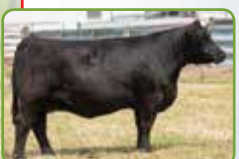
Harkers Dinah Mite D133 Dam

Viewing & Bidding Available Online! LiveAuctions.TV