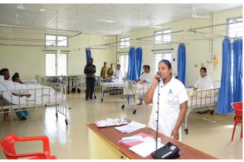
A large and spacious ward at Chittoor