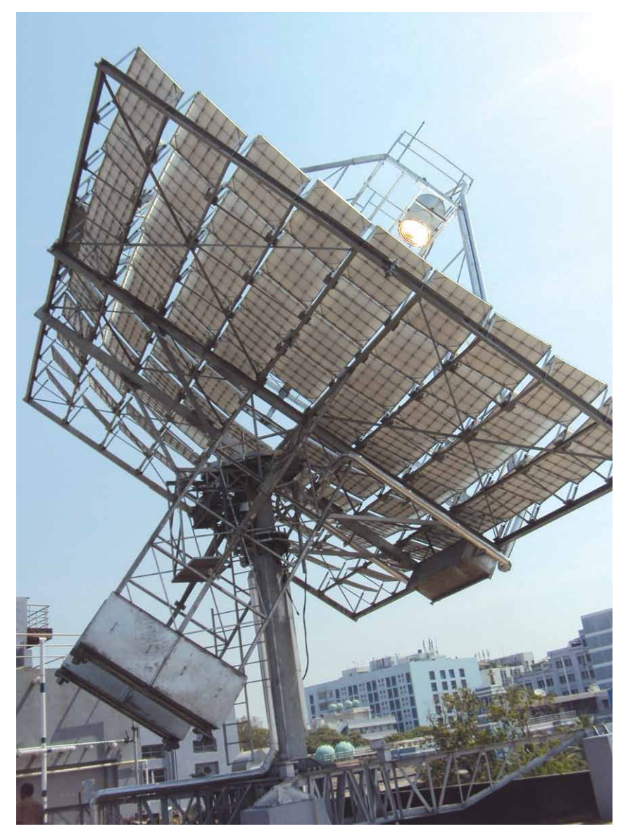
Solar Panel for Water purification system