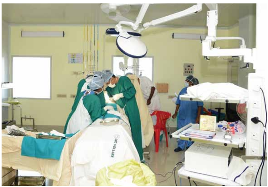
One among the four operation theatres at Chittoor