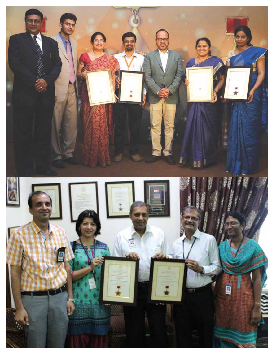
The Skoch Swasth Bharat Awards 2017

• Departments of ENT and Dental & Oral Surgery-I received the Order-of-Merit award at the 45<sup>th</sup> Skoch summit held at Hyderabad on the 7<sup>th</sup> and 8<sup>th</sup> of September, 2016, for their hospital-based Neonatal Hearing Screening (NHS) Programme and Tobacco Cessation Programme respectively.