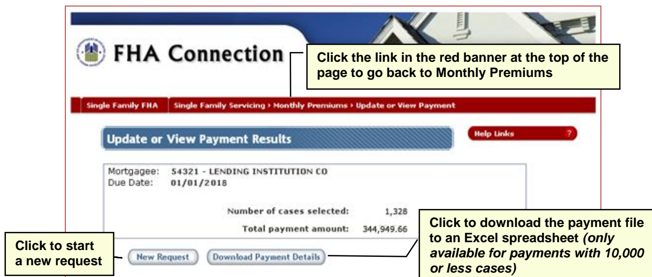
Figure 6: Update or View Payment Results page

10. On the Update or View Payment Results page (Figure 6), you can: