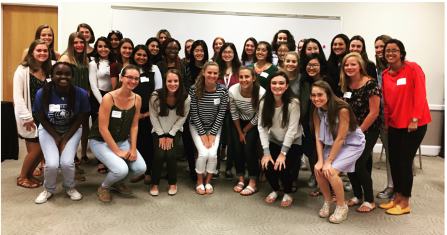
CURRENT MEMBERS OF THE WOMEN'S LEADERSHIP PROGRAM

Most of the students in the WLP have already proven themselves as leaders with their past experiences and are involved in a plethora of other organizations on campus. This is a community for Bentley women from diverse backgrounds and interests to come together and discuss some of the gender inequities they see in their daily live and, specifically, on campus.