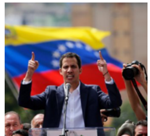
JUAN GUAIDÓ AT A RALLY

In effect, on January 23rd, the opposition, which gained control of National Assembly in the last legitimate elections in 2015, appointed Guaidó as interim president of Venezuela. This was possible because in 2018, Maduro was unconstitutionally and undemocratically elected through a sham election that had no opposition, coerced citizens to vote for him, had manipulated voting ballots, and disallowed international oversight. Therefore, under Article 233 of the Constitution, the President of the National Assembly legally takes