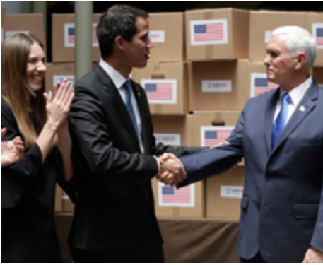
JUAN GUIDÓ WITH UNITED STATES VP MIKE PENCE

charge of the presidency and this man happened to be Guaidó.