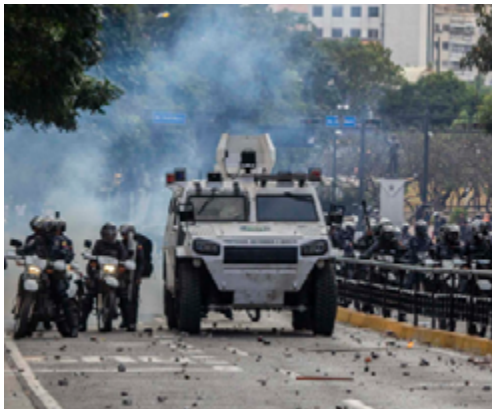
GOVERNMENT FORCES RETALIATING AGAINST PROTESTERS

72 hours and counting. As I write this article, my home country is enveloped in darkness. Not just the darkness of the massive blackout that has struck the nation over these past few days, but the darkness that has loomed over the past two decades as the result of a corrupt and tyrannical dictatorship.