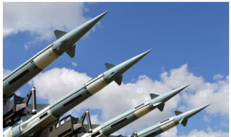
RUSSIA'S ISKANDER NUCLEAR-CAPABLE SHORT-RANGE MISSILE SYSTEM

US nuclear doctrine is not suited against this threat because the US