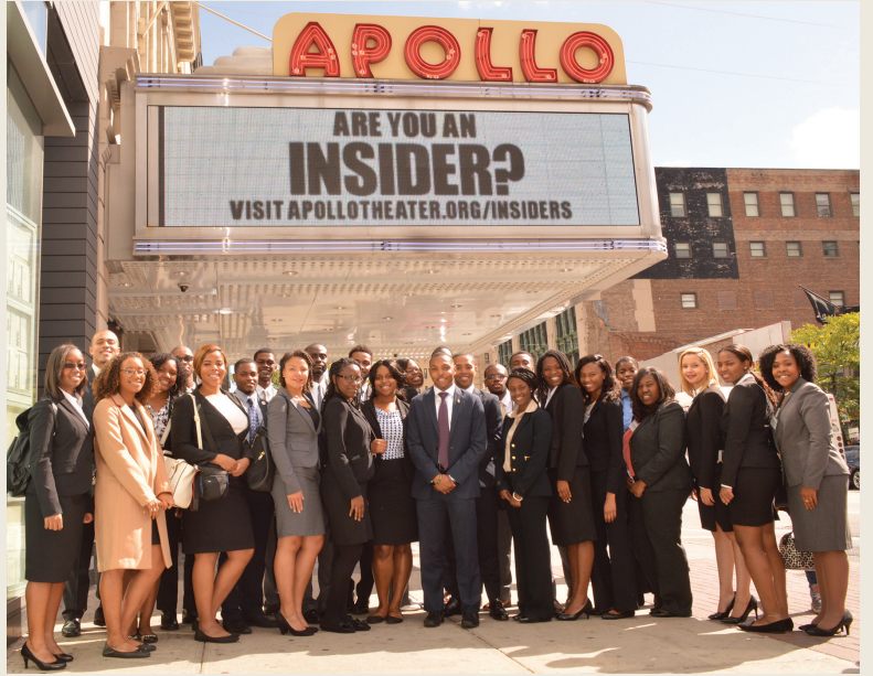
ELC scholars visit the World-Famous Apollo Theater in New York City.

Scholars begin their week in New York City where they visit global companies and engage in one-on-one meetings with senior-level executives. The scholars will visit select cultural sites and attend evening receptions and/or dinners with ELC members and other senior executives. The scholars end their Symposium experience in Washington, D.C. where they attend The ELC's Annual Recognition Gala.