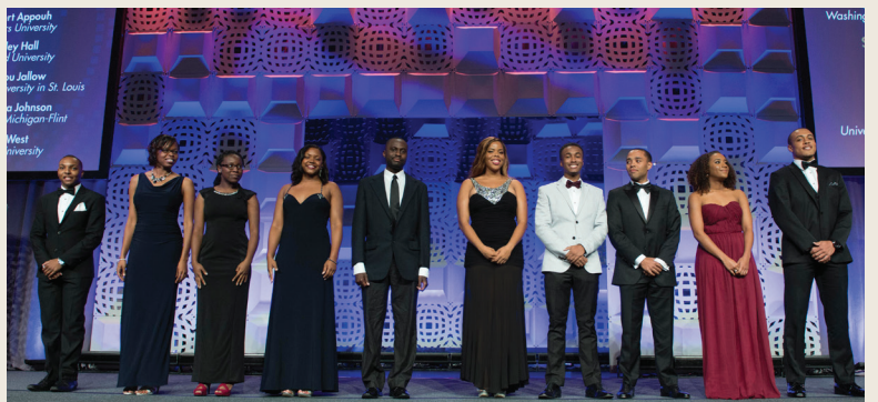
ELC scholars recognized on stage at The ELC's Annual Recognition Gala in Washington, DC.

For more information, please contact The Executive Leadership Council at (703) 706-5200 or scholarships@elcinfo.com