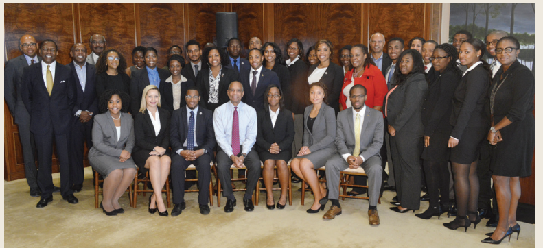
ELC scholars with American Express Chairman & CEO Kenneth Chenault.