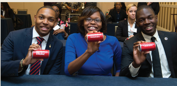
ELC scholars attend a leadership session sponsored by The Coca-Cola Company.