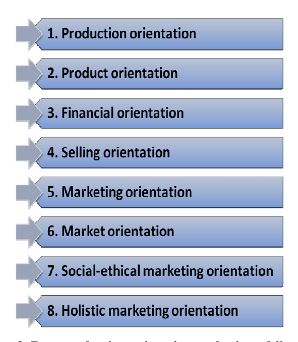
Figure 2. Proposed orientations in marketing philosophy