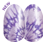
Strict Dye-It FDS537 shimmer

#BeColorful™ #BeBrilliant™ #BeColorStreet™