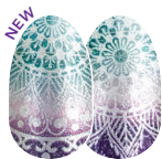
Drop & Give Me Zen FDS538 shimmer