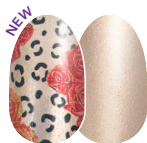
Catitude Problem FDS533 shimmer