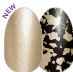
Don't Flake On Me FDS536 shimmer