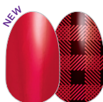
Good Girls Gone Plaid FDC242 creme