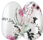
Flora Good Time FDS507 shimmer