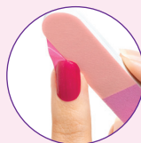
GENTLY FILE EXCESS OR REMOVE WITH FINGERNAIL