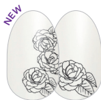
Anything Rose FDL034 clear