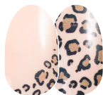
Trend Spotted FDC229 creme