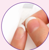
APPLY OVERLAY TO NAIL