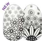
How's It Growing? FDL033 clear