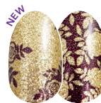
Rose Were the Days FDG292