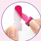
PEEL POLISH STRIP