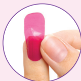
APPLY TO NAIL & GENTLY STRETCH TO FIT