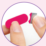
REMOVE TAB & SELECT END