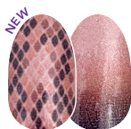
Pick Your Poison FDS534 shimmer