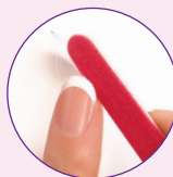
GENTLY FILE EXCESS OR REMOVE WITH FINGERNAIL