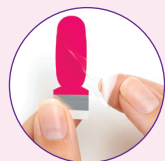
REMOVE CLEAR COVER