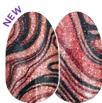
Best of Both Swirls FDG293