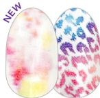
Pigment of Your Imagination FDF262 frost