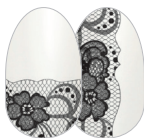
I Love Lacey FDL028 clear