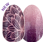
Rule of Plum FDS532 shimmer