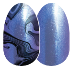
Northern Wonder FDS484 shimmer