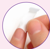
REMOVE CLEAR COVER & APPLY TIP TO FREE EDGE OF NAIL