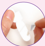
REMOVE CLEAR COVER & PEEL POLISH OVERLAY