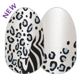
Zebra on the Spot FDS535 shimmer