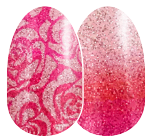
Rosé All Day FDG267