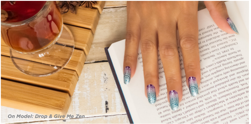
On Model: Drop & Give Me Zen