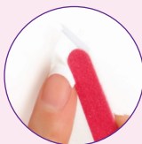
FILE EXCESS OR REMOVE WITH FINGERNAIL