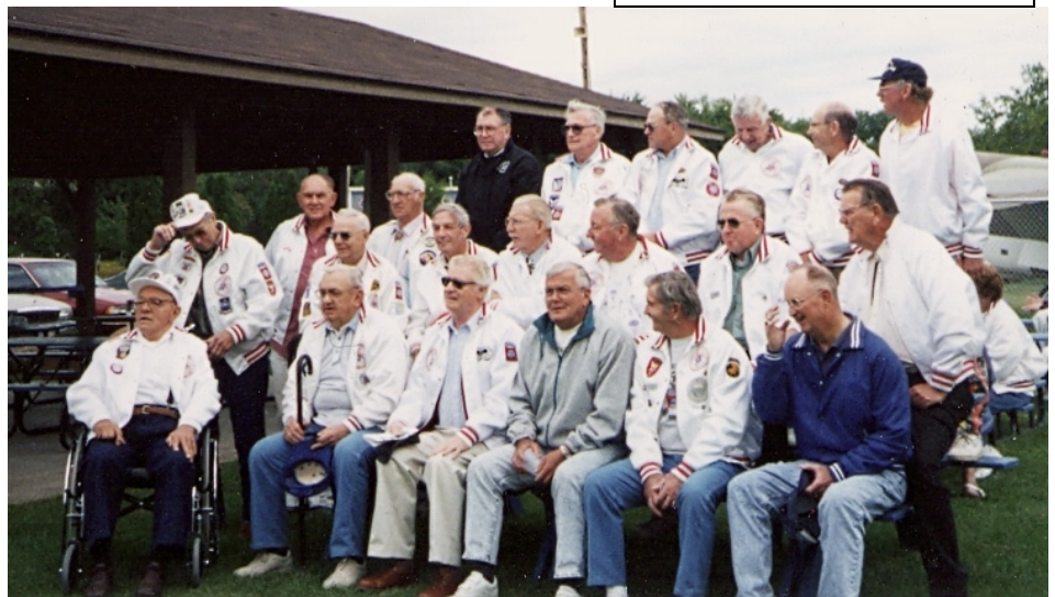
Do you know these Airborne guys? Send us the names if you do!