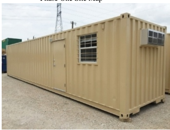
Manufactured Container Housing