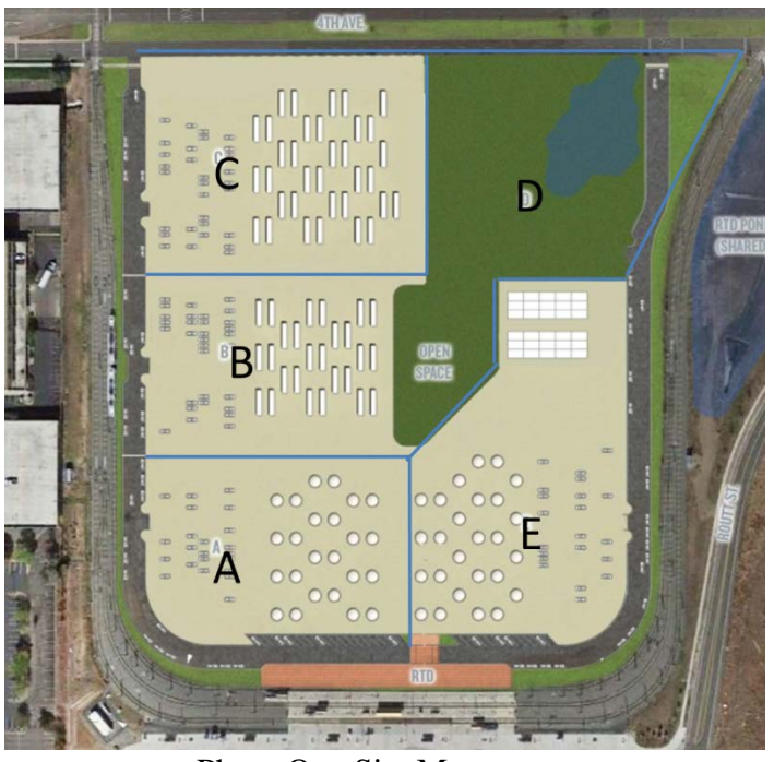
Phase One Site Map