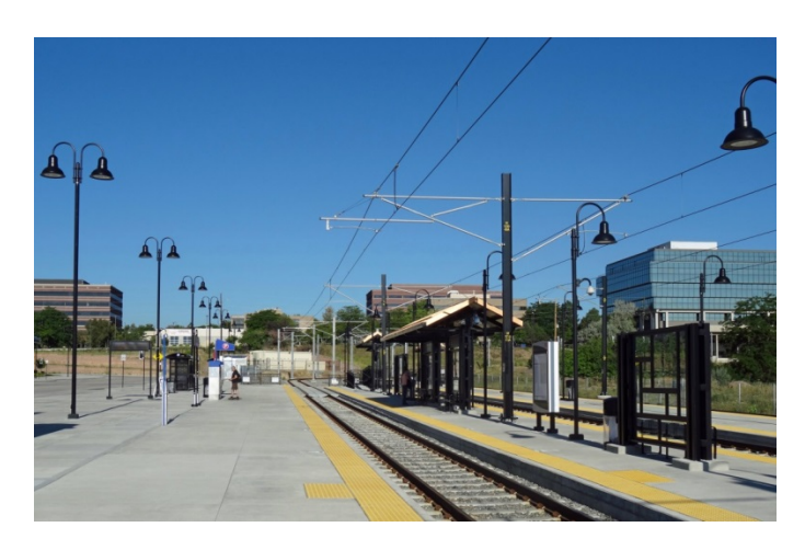
Federal Center Station Surplus Property