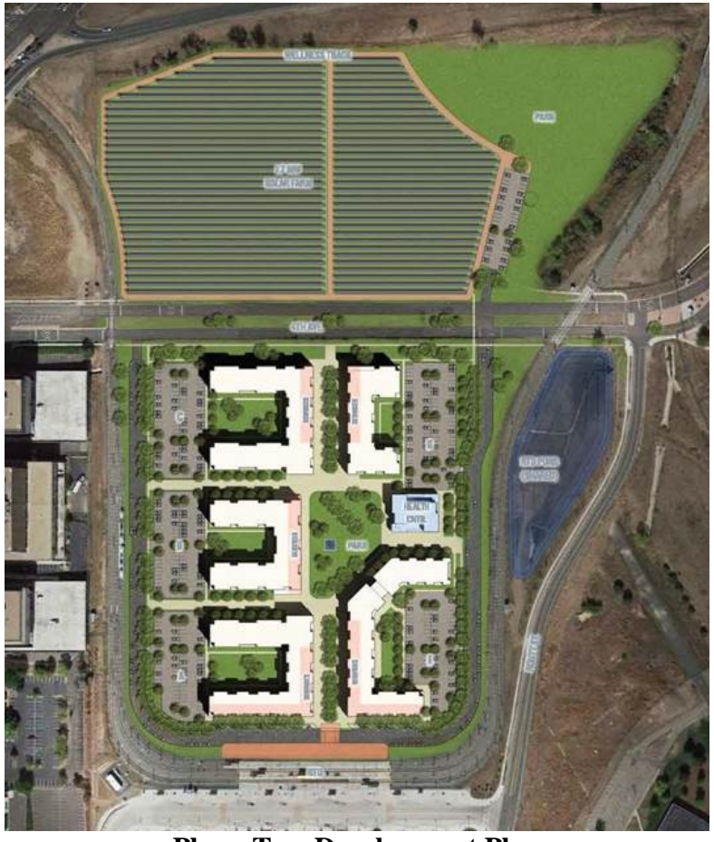
Phase Two Development Plan