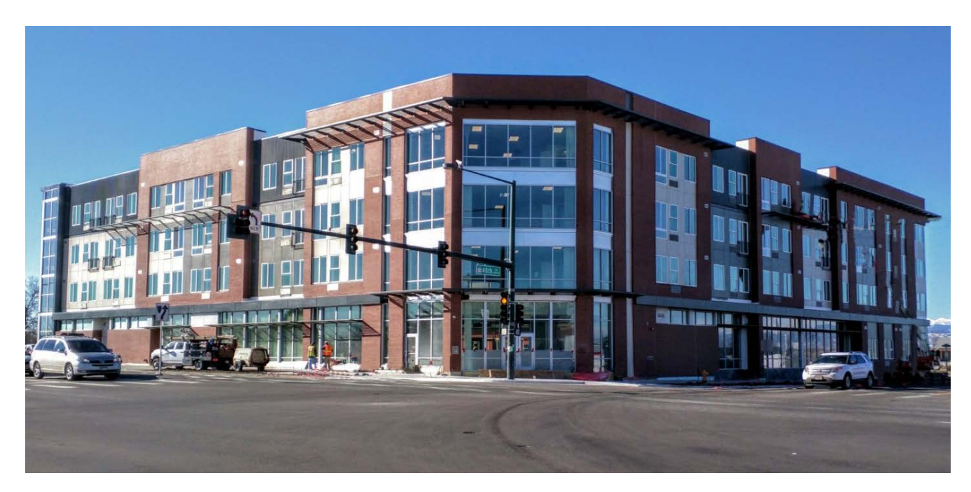
Renaissance at North Colorado Station, Completed 2016