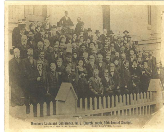
Members of the Louisiana Conference, Methodist Episcopal Church, South, 1882.