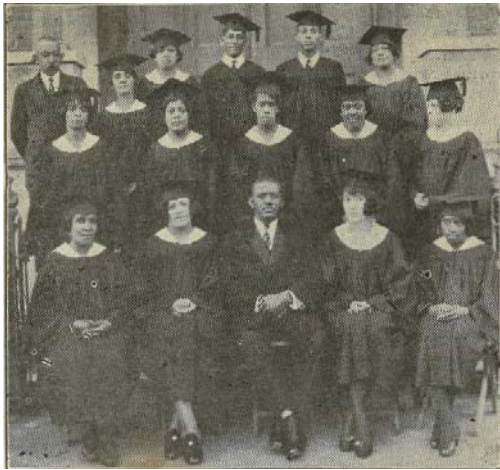
Choir of Grace Methodist Episcopal Church (New Orleans, La.), 1929.