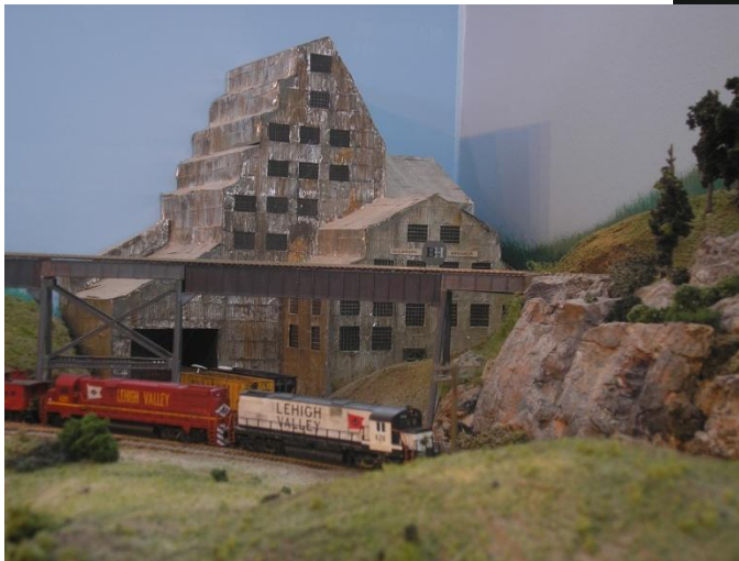
NE-84 arrives at Sibley Junction from the Lehigh Valley Coxtan Yard. The Delaware breaker is in the background.