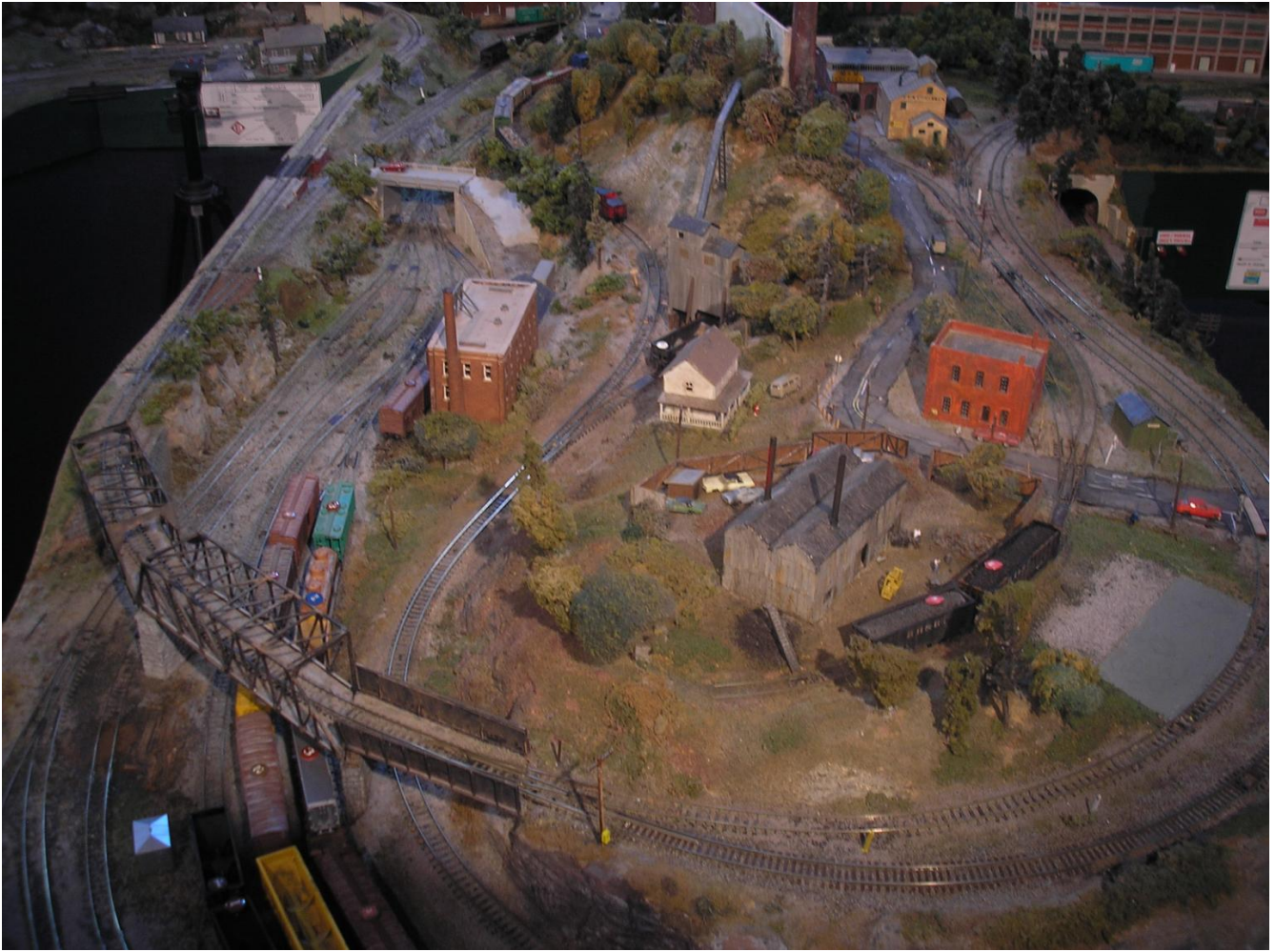
An overview of the Scranton peninsula. Track on the upper level is not associated with Scranton. Track under the truss bridge is the Scranton CNJ interchange. The tunnel in the upper right is near Capouse Junction.

Mayfield Yards. Traffic from Scranton and the Capouse Branch are brought to the Mayfield Main Yard to be made into northbound trains. The old Mayfield Coal Yard is used for southbound classification. Most trains originate and terminate in Mayfield. Symbol freights such as NE-84 and 97 pass through Mayfield, setting out a block of cars and picking up a block of cars in the yard.