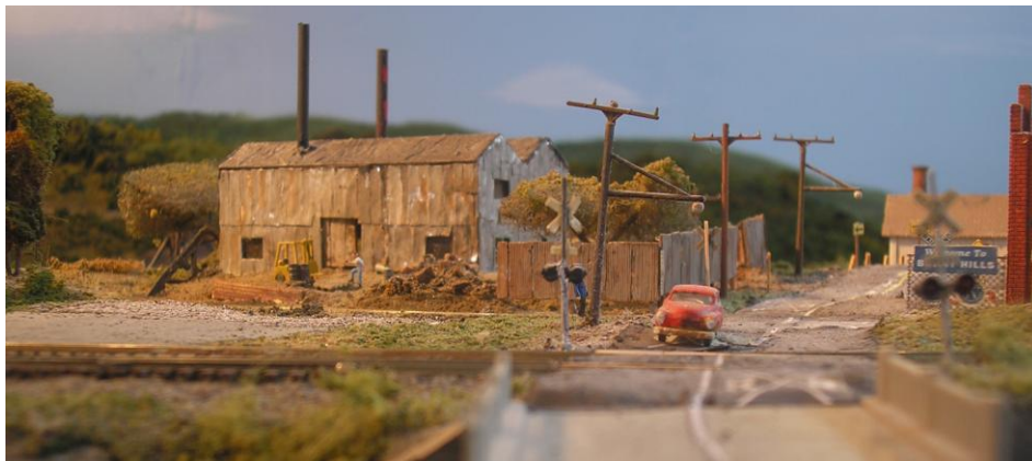
Spear Machine Co