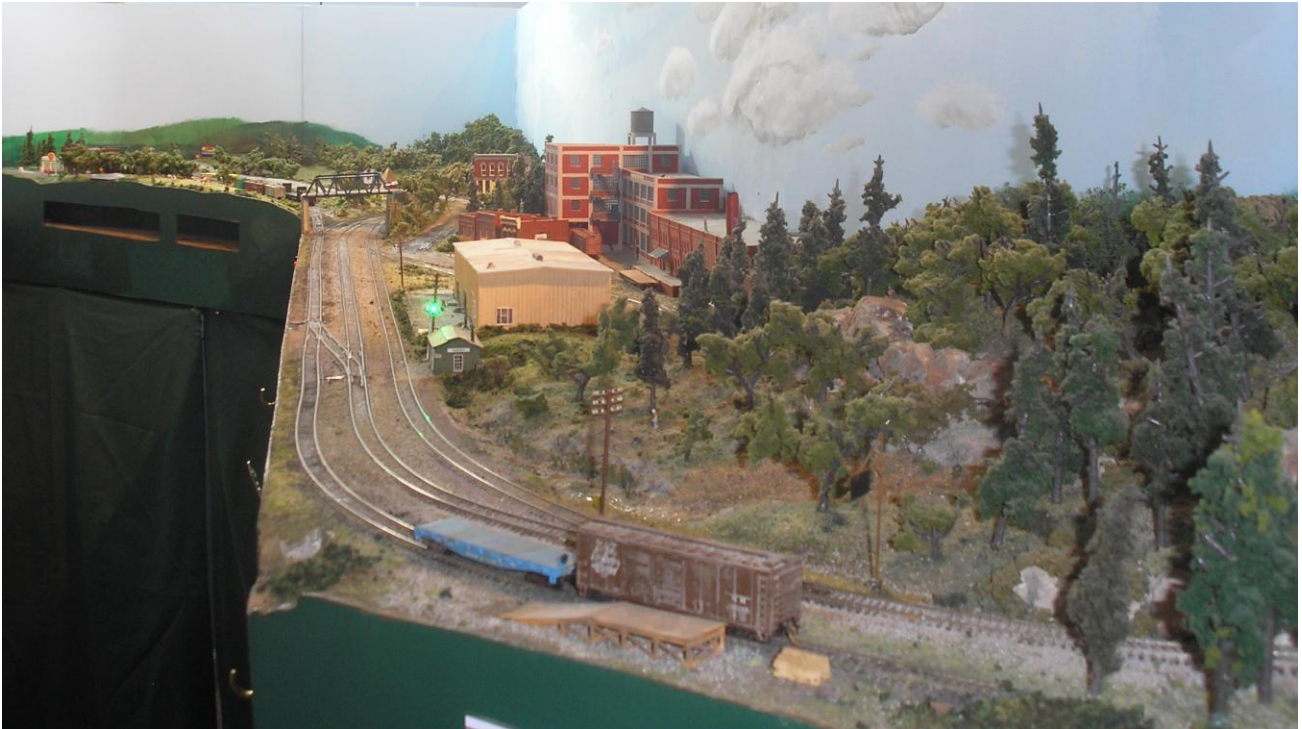
Overview of Sidney NY

The final stop on the layout tour is the five track staging yard for the north end of the layout. Each track is long enough to hold two trains. The following destinations are represented: