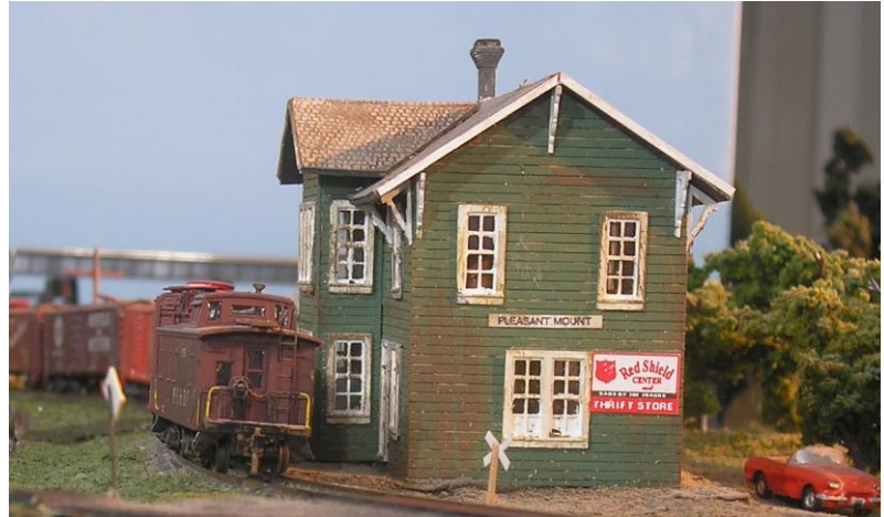
Caboose of the Burnt Hills Local passes Pleasant Mount station.

The railroad then proceeds to Cadosia NY.