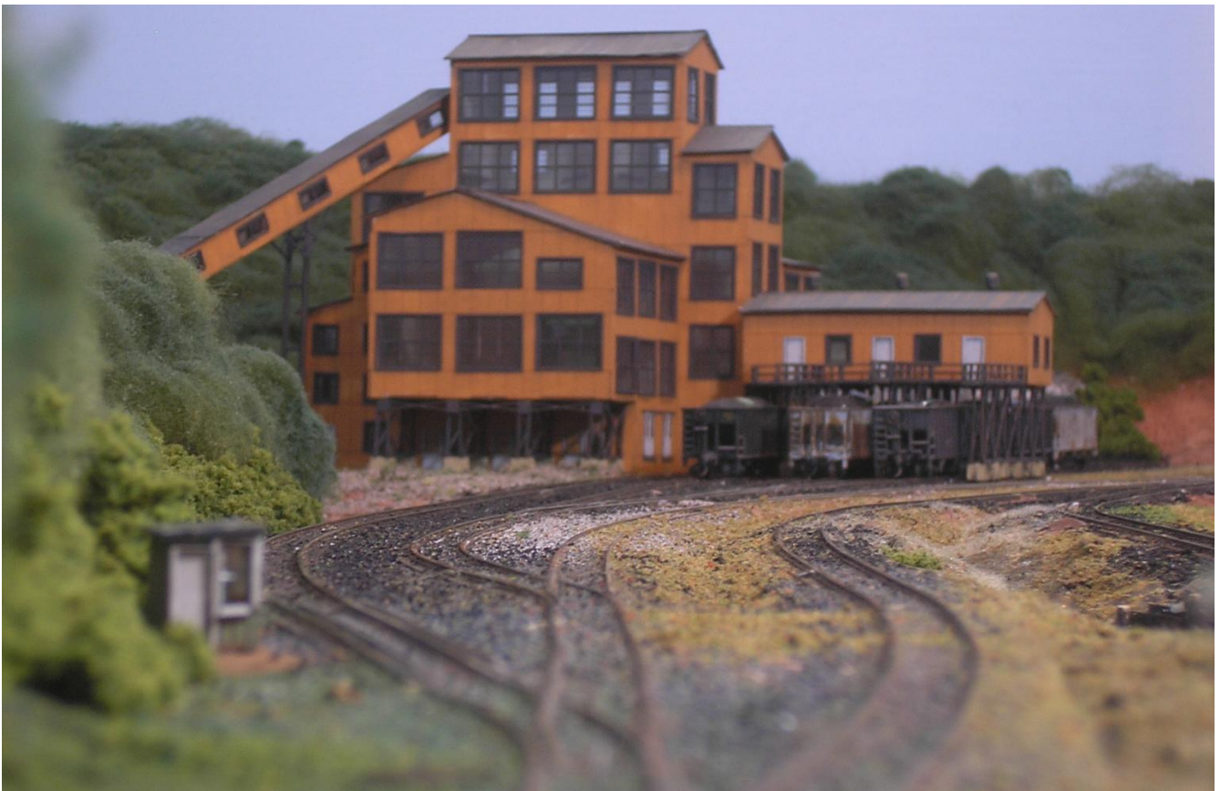
Richmondale Breaker. Note scale track on left