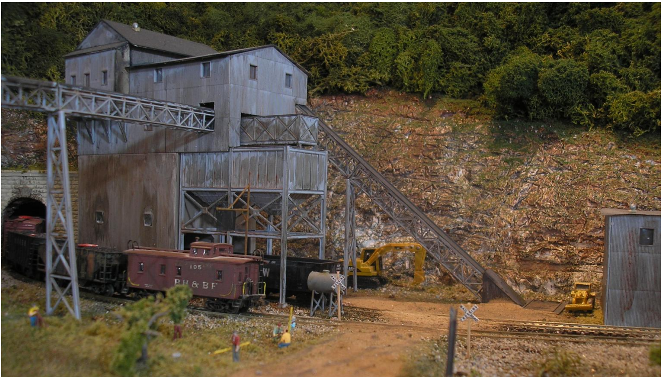
Gravel plant near the Northfield tunnel southern portal.

Sidney was the division point between the O&W Southern Division and the Northern Division. The primary yard for the Northern Division was at Norwich NY. Sidney hosts the Delaware and Hudson interchange. The BH&BF history assumes that as part of DEREKO, some traffic between Scranton and Sidney has been rerouted over the lower ruling grade of the BH&BF as compared to the Delaware and Hudson route.