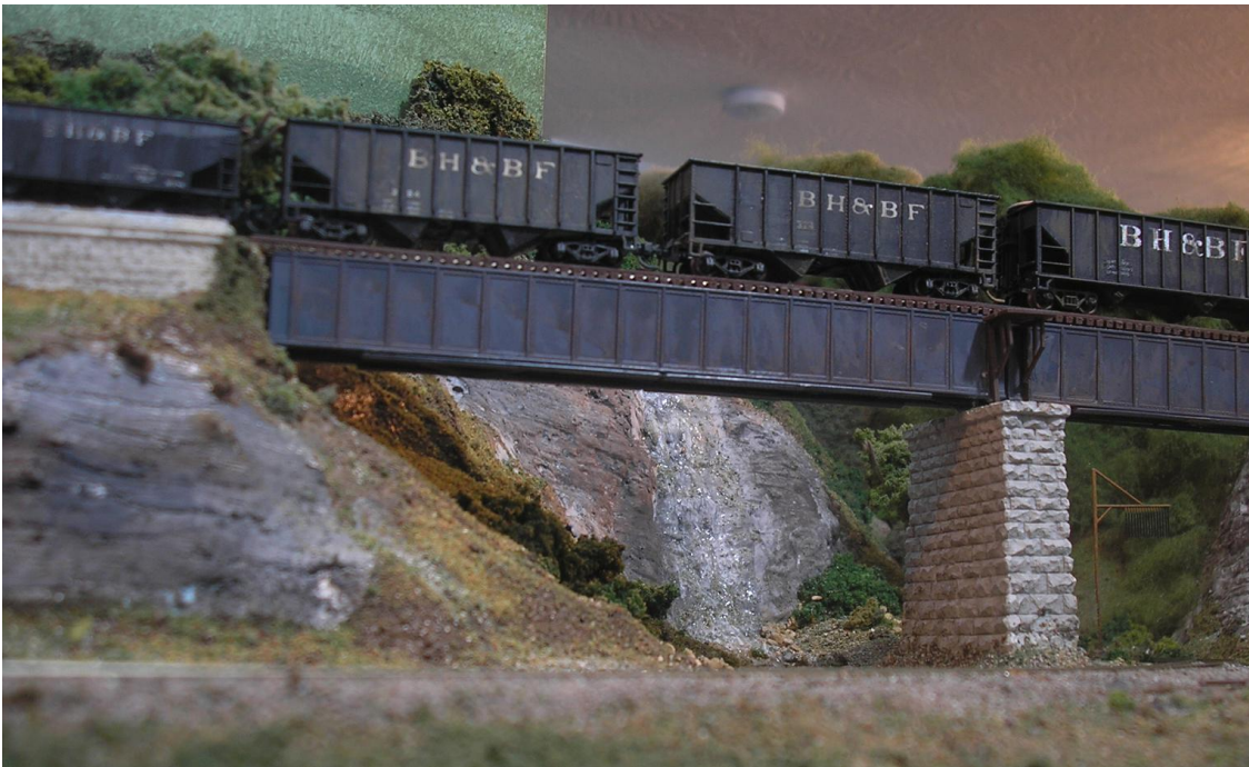
Exiting the dormer, the main crosses Decker Viaduct. Decker Falls may be seen under the viaduct.