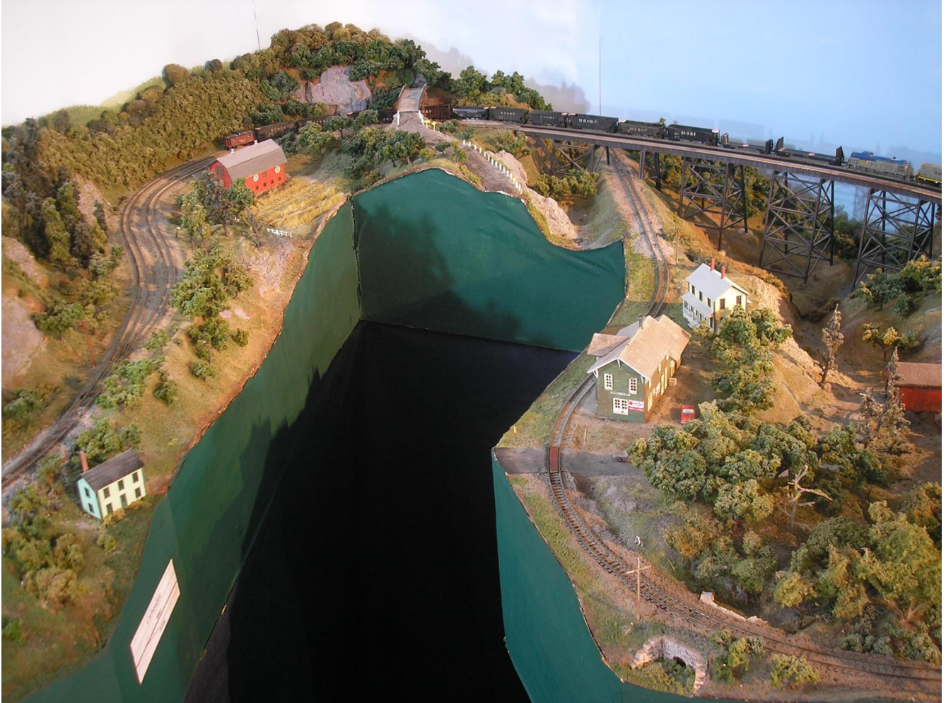
Overview of the Carbondale siding, and Pleasant Mount (bottom center).

On the Carbondale peninsula, the main loops back under itself and heads back to the dormer. The Northwest Branch leaves the main at Carbondale and heads into the second dormer as a dead-end branch.