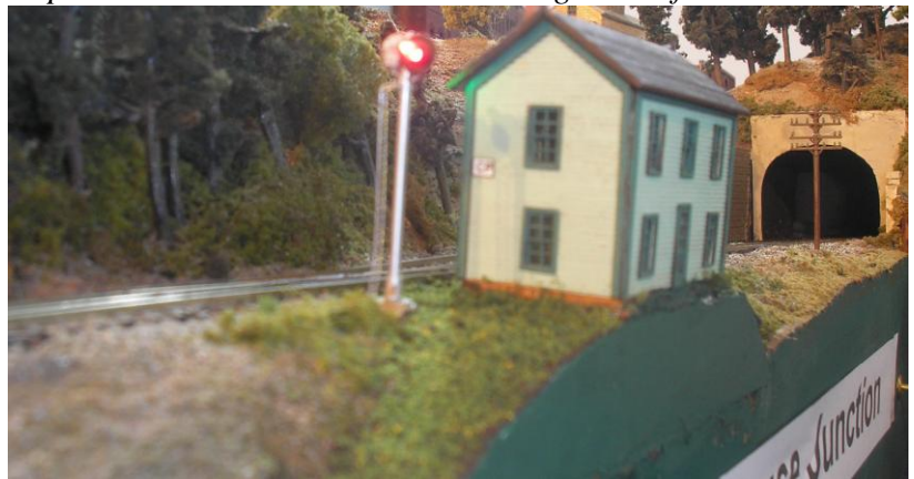
Capouse Junction with Train Order signal set for orders

Scranton is serviced three to four times per day by the Southern Mine Run. This train shuttles between Mayfield yard and Big Flats and Scranton as needed during the operations of the railroad.