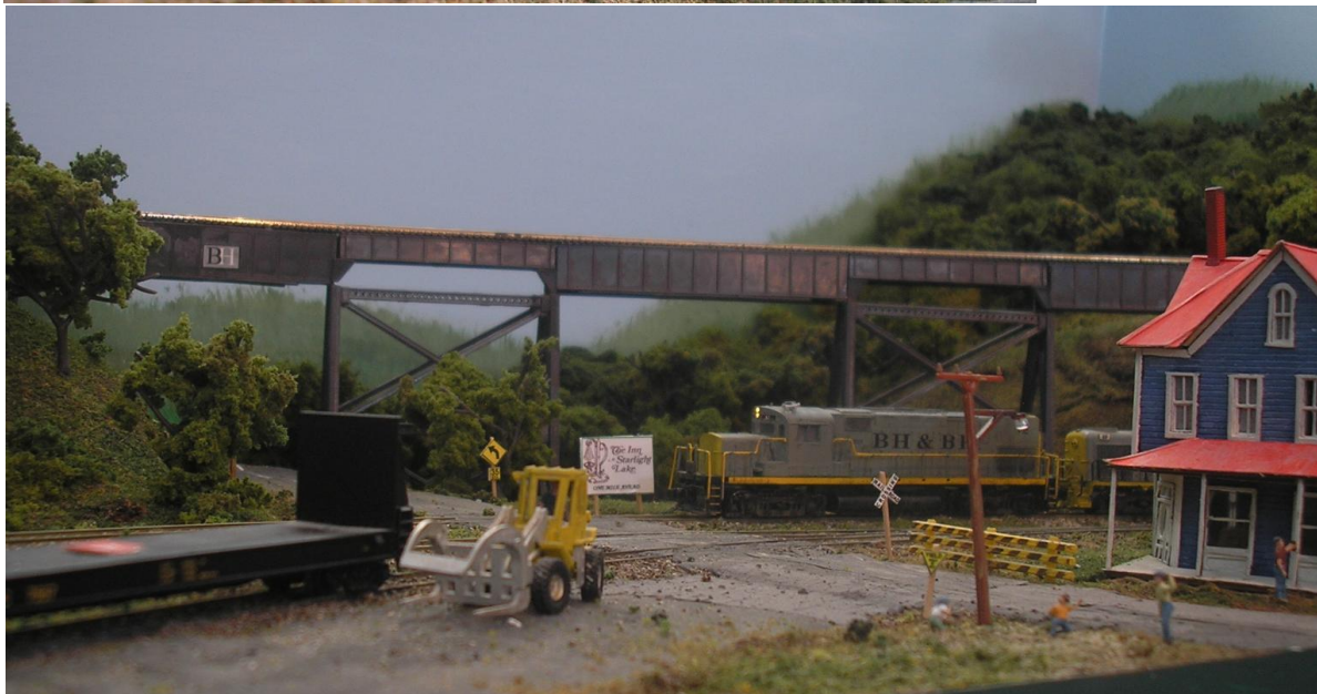
The Burnt Hills Local approaches the Starlight grade crossing. An empty pulpwood flat and loader await a delivery of pulpwood.