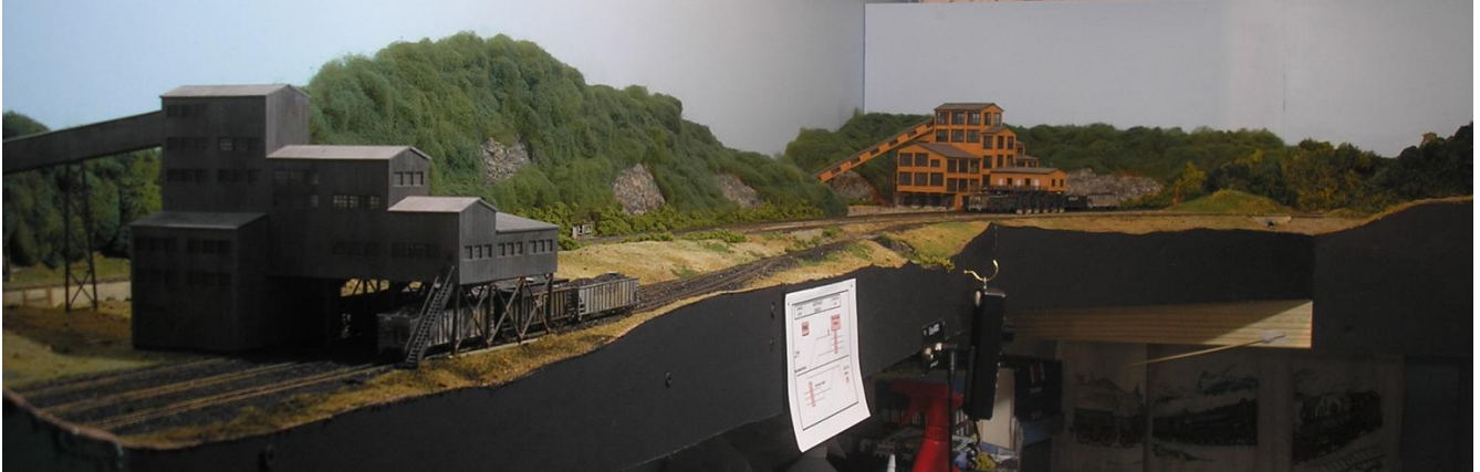
Anthracite breakers on the Northwest Branch. Northwest Breaker on left, Richmondale Breaker on right.

The Northwest Branch leads to two major coal breakers, a truck unloading ramp, a team track, and a pulpwood loading siding. The Northwest Branch leads to the northern-most anthracite coal fields in the Scranton area. Loads from the branch are hauled back to Mayfield yard for classification. Pulpwood loads head for the Delaware & Hudson interchange in Sidney NY.