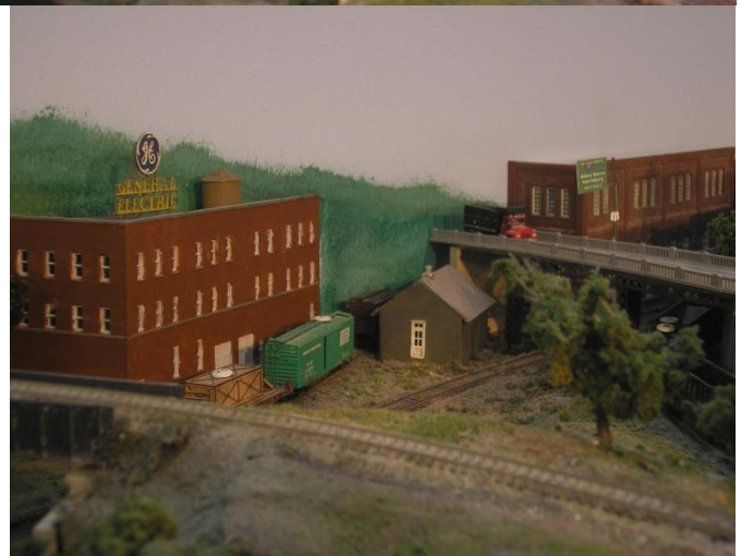
The Capouse Branch heads northward towards Capouse Junction and Mayfield under the US Route 11 viaduct.

First Class freight trains NE-84 and 87 connect Washington DC with Portland ME via the B&O, Reading, Lehigh Valley, BH&BF, Delaware & Hudson, Boston & Maine, and Maine Central. This service provides competition with the troubled Penn Central. The connection to the Lehigh Valley is made via a two track staging yard, each track of which can hold two trains. The prototype NE-84 and 87 made so many changes of directions at interchanges, the train carried a caboose at each end to save time on train runarounds.