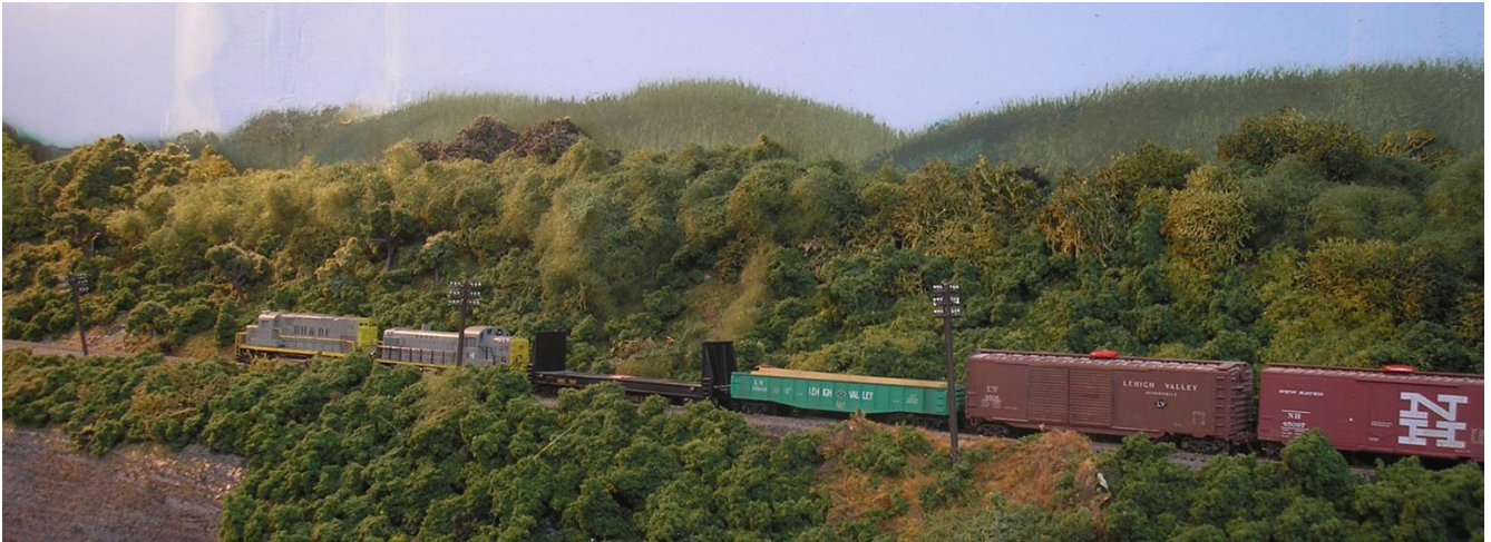
Climbing upgrade to Northfield tunnel.