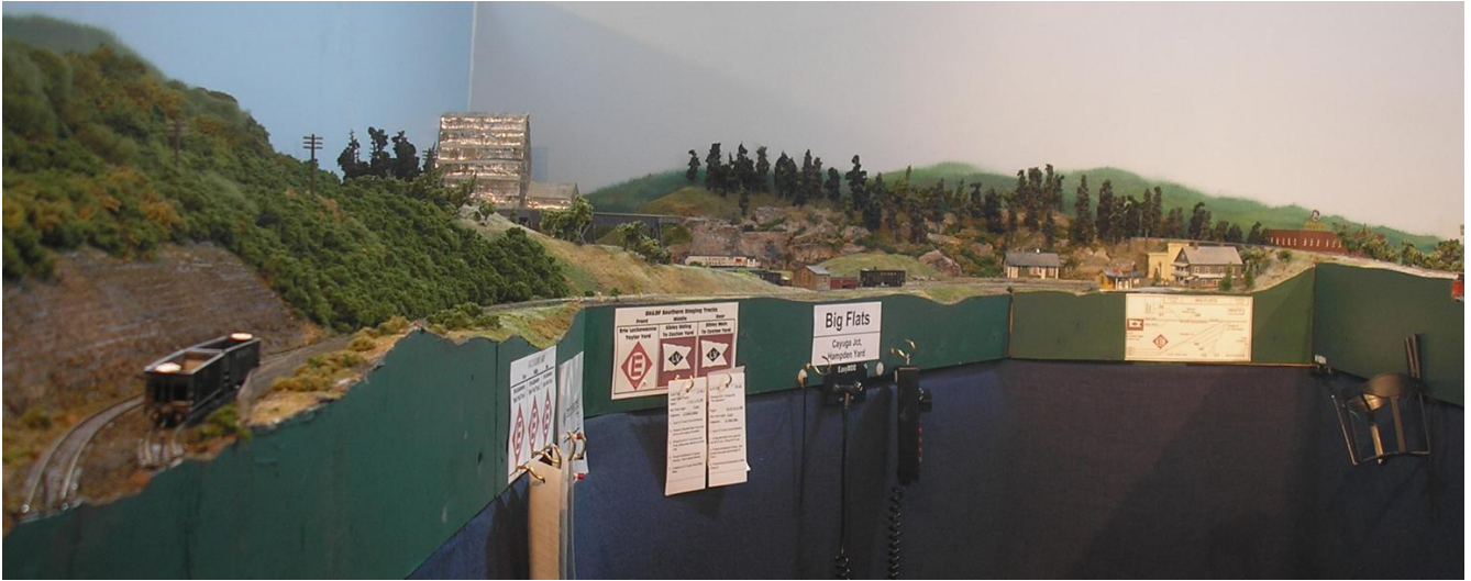
View of the Capouse Branch / Big Flats area.

Capouse Junction. Capouse Junction marks the end of the Capouse Branch. The mainline heads southbound to Scranton via the left hand track of the tunnel. Labels on the fascia attempt to show the operators which way to go.