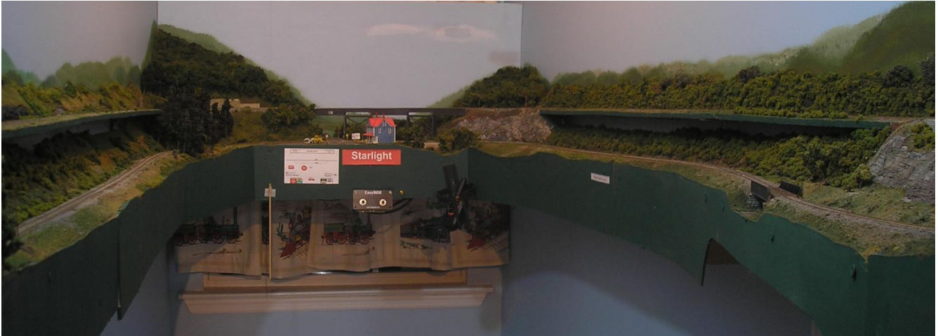
An overview of the Starlight dormer

The twenty foot square room in South Carolina provided two challenges – two dormers of 42 inch width and 10 foot long. Too much real estate to pass up, but very narrow. Fortunately, in N Scale a turnback curve could be laid. Where the existing layout was broken apart in front of the first dormer, I intended to send only the lower level into the dormer, and have the upper level cross on a gate. However, John Decker (from Washington) convinced me to try double decking the dormer. The lower shelf is only 6 inches wide and the upper 3 inches. I put in only basic scenery, except in the turnback curve. The effect is reasonable, and provided an extra scale mile of trackage on the two levels.