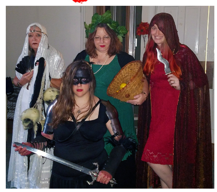
The Morrigana, our four goddesses of Samhain