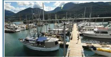
Aurora Harbor Rebuild, Juneau