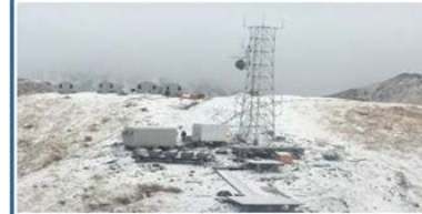
USCG Rescue 21 AK Remote Sites