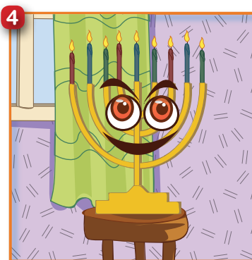
4 Never leave lit c _ _ d _ _ s unattended.