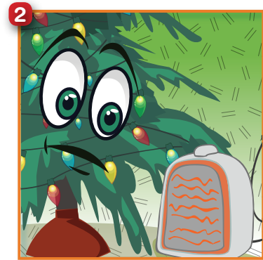
2 Keep the space h _ _ _ t _ r far away from the tree and other decorations.