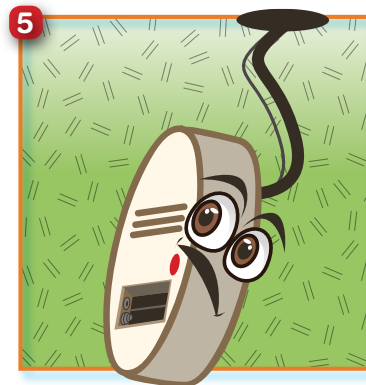
5 Have an adult test sm _ k e a _ _ _ r m s every month.

ANSWERS: 1. outlet; 2. heater; 3. cooking; 4. candles; 5. smoke alarms.