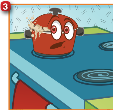
3 Make sure an adult pays attention to food that is c _ _ o k _ _ _ g.