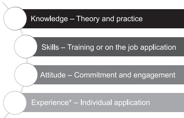
FIGURE H.2.A Competency Factors