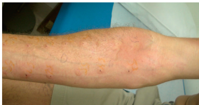
Figure 3. Percutaneous allergy skin test results: measuring the wheal and flare and erythema.

A food allergy is typically defined as an adverse immune response to the proteins in a food. This may occur as the result of a humoral response (IgE antibody), a cellular response (eg, T cells), or both. This monograph does not present a comprehensive approach to the diagnosis and management of adverse reactions to foods; rather, it summarizes the appropriate focus of an initial primary care office-based evaluation with emphasis on using serum s-IgE tests. For more comprehensive reviews of food allergy testing, the readers are referred to the Food Allergy Practice Parameter 32 or the American Academy of Allergy, Asthma and Immunology practice paper on food allergy diagnosis. 33 Although approximately 20% of people alter their diet for perceived adverse reactions to foods, it is estimated that only 3% to 5% have an immune response (allergy). Unnecessary food avoidance could have social, emotional, and nutritional conse-