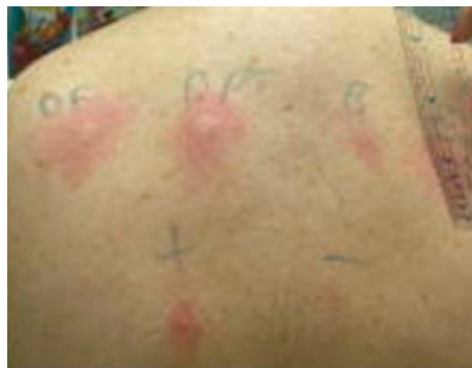
Figure 6. Percutaneous allergy skin test results: measuring the wheal and flare and erythema.

identify a nonallergic cause for symptoms (intolerance, pharmacologic effect), may exclude or implicate IgE antibody-associated mechanisms, and may help to identify specific causal foods. Testing should not proceed if symptoms are not likely to be food related or not likely to be associated with IgE. A convincing history (for example, 2 episodes of anaphylaxis to isolated ingestion of walnut) with a positive test result (in this example for walnut s-IgE) provides excellent diagnostic accuracy. In some situations, the history and/or test results may be indeterminate, in which case an allergist may use more sensitive tests (skin tests, elimination diets, and physician-supervised oral food challenges) to confirm or refute a specific food trigger.