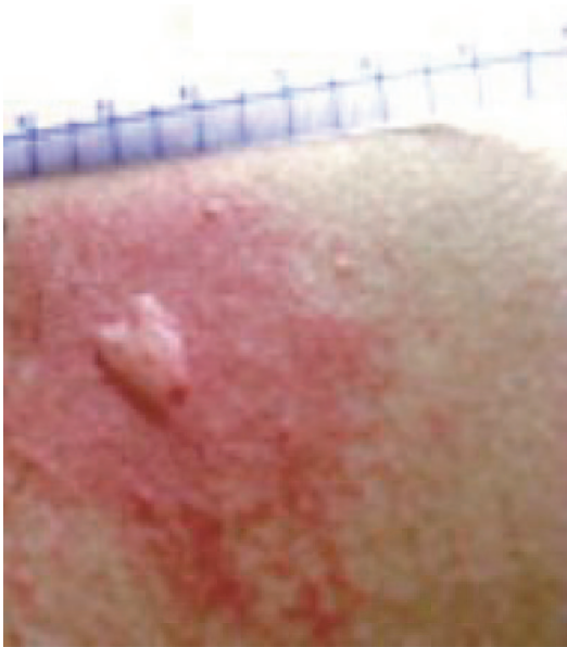
Figure 5. Percutaneous allergy skin test results: measuring the wheal and flare and erythema.