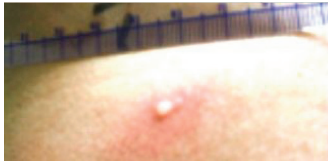
Figure 4. Percutaneous allergy skin test results: measuring the wheal and flare and erythema.

Like all other laboratory tests, skin test quality assurance standards should be met to ensure that accurate testing technique is being performed. To confirm such standards, it is recommended that all technicians performing skin testing undergo evaluation of their technique. Suggested proficiency