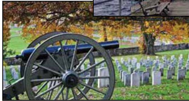
Above: Seneca Lake Left: Gettysbrug Below: Sight and Sound, Lancaster