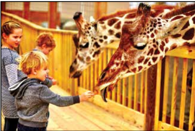
Above, right: Horseshoe Curve Above: Longwood Gardens Left: Animal Adventure Park Below: Penn's Cave