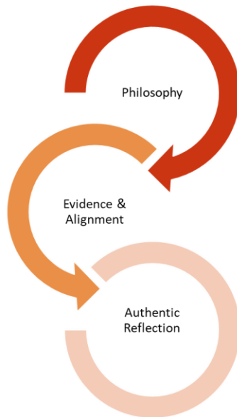
Figure 4: Key components of a dossier. Adapted from: McDonald et al., (2016).

Once you have drafted a teaching philosophy and/or educational leadership philosophy statement, you will be able to begin creating your dossier. Remember that your dossier is a curated document compiled for a specific purpose. Some people therefore find it helpful to maintain an ongoing set of evidence and artifacts used in their teaching and educational leadership practices from which to curate and choose examples. There are three key components to consider when creating a teaching dossier and/or educational leadership dossier: 1. Philosophy, 2. Evidence and Alignment and 3. Authentic reflection (Figure 4).