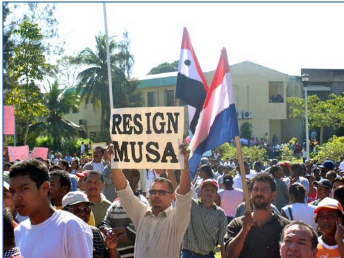
Irate protesters in Belize