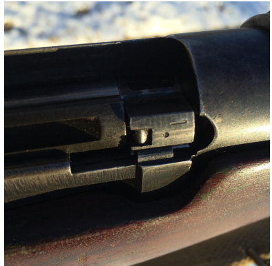
Figure 23: The Long Branch rail cutout. Compare with Figure 21 above.

To replace the bolt in a Canadian rifle, screw the bolt head in as described above for British rifles. Then offer up the bolt to its raceway and push it into the rifle body until it stops.