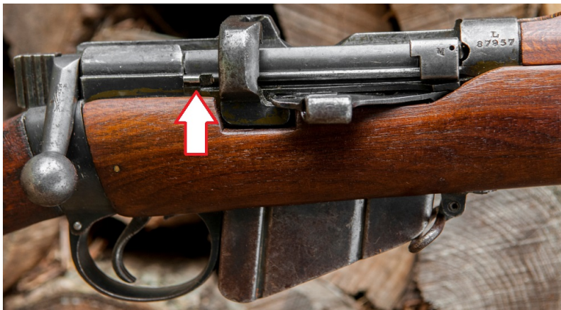
Figure 20: The arrow indicates the SMLE bolt head retaining spring.

The SMLE bolt is retained by a spring on the right hand side of the receiver. To take the bolt out of the rifle, pull it fully to the rear. Firmly grasp the bolt head and rotate it to the 12 o'clock position. It will ride over the spring detent when it is rotated.