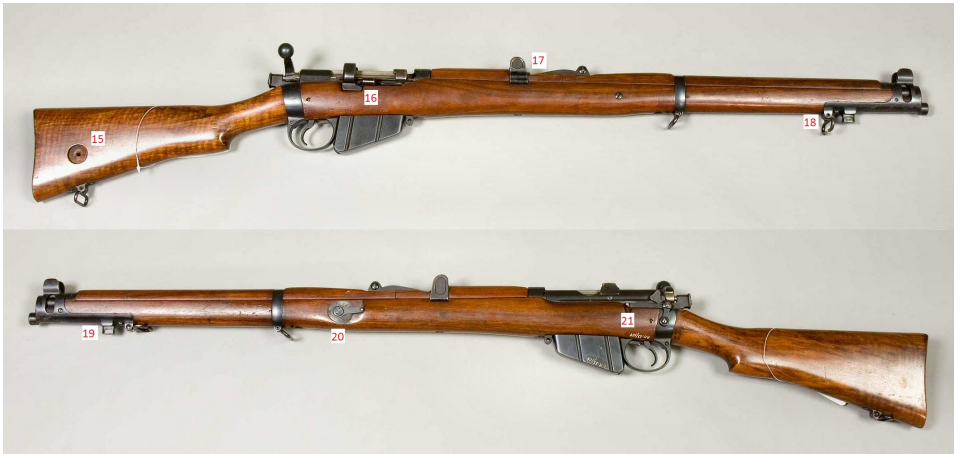
Figure 3: A SMLE Mk.III fitted with volley sights