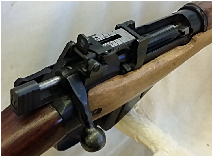
Figure 5: A No.4 ready to fire. The bolt is cocked and the safety catch is on