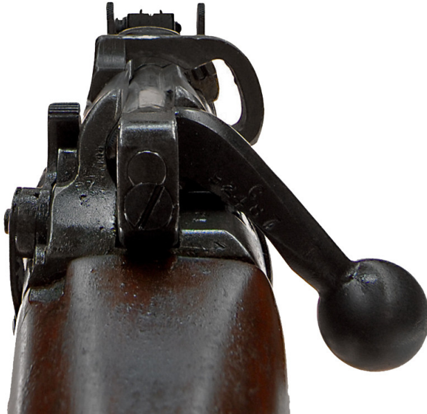
Figure 13: View down the sights of an SMLE. Note position of foresight blade within the notch of the rear sight.