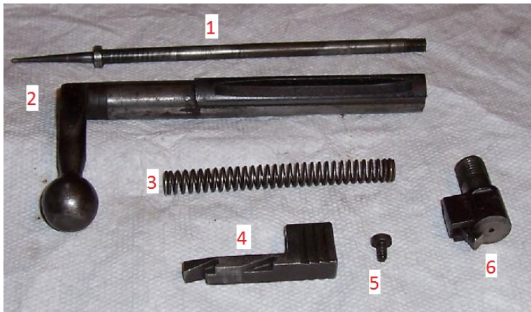
Figure 18: A No.4/No.5 type bolt stripped.

The Lee Enfield bolt consists of 6 main parts: the bolt body; the bolt head; the cocking piece; the striker; the striker retaining screw; and the mainspring.