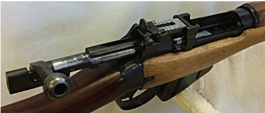
Figure 6: An unloaded No.4. The bolt is open and the magazine is empty

A breech flag is always inserted in the chamber when the rifle is not in use on the firing point. Where a breech flag is not available, the bolt should be removed instead.