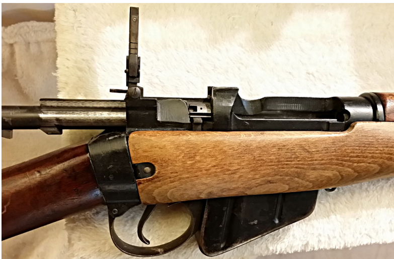
Figure 21: Note how the bolt head is sitting on top of the bolt head catch

To remove the bolt from a British rifle, push the bolt forward an inch or so. Press and hold down the bolt head catch and pull the bolt fully to the rear, letting the bolt head ride over the catch; then let go of the catch.