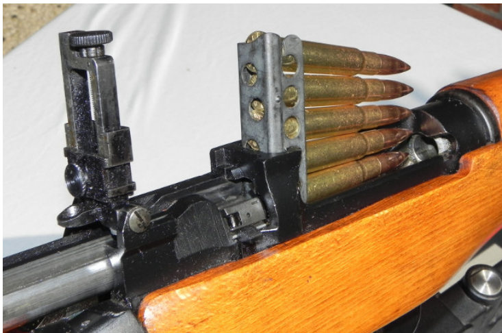
Figure 7: Figure 7: The charger clip in position on a No.4.