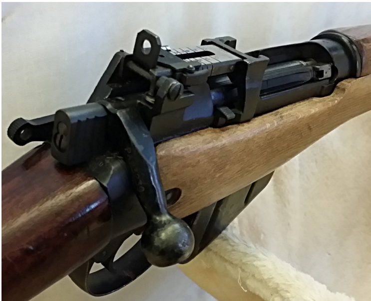
Figure 4: A loaded No.4. The safety catch is on and the bolt is not cocked (the striker is forward)