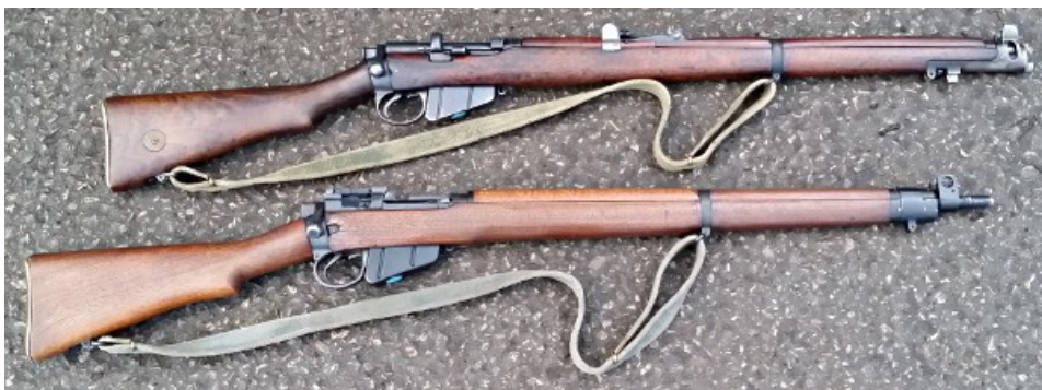
Figure 1: An SMLE (top) and a No.4

The resourceful instructor will realise that the basic drills described in chapter 2 can be adapted for most manually operated magazine-fed bolt action rifles. This pamphlet, however, is not a replacement for the manufacturer's own instructions.