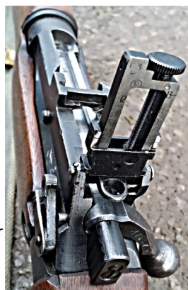
Figure 8: Mk.1 'Singer' rearsight with vertical adjustment wheel

Almost all Lee Enfield rifles are iron sighted except for the L42A1 and the No.4(T) sniper rifles. This pamphlet does not cover the telescope sighted rifles because they are almost never found as club or shared rifles due to their high value.