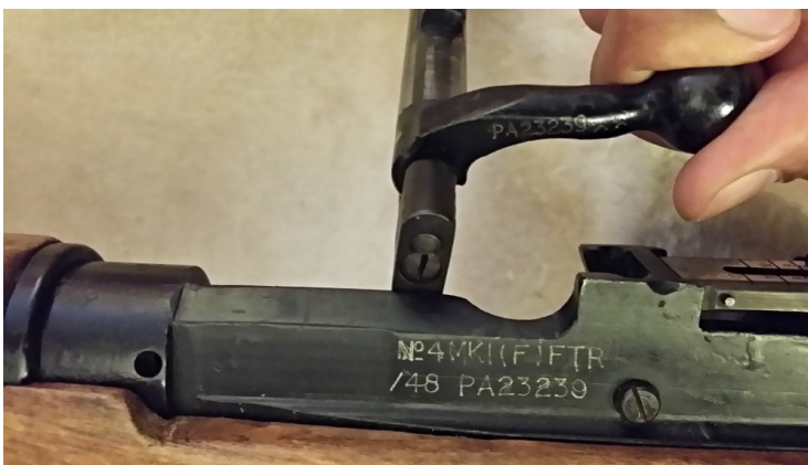
Figure 19: No.4 serial number locations: back of the bolt handle and left hand side of the receiver

The rifle receiver and bolt body should be numbered to match each other, though a significant minority of No.4 and No.5 rifles are mismatched. For these two rifles, the serial number is found on the rear of the bolt handle and on the left hand side of the rifle receiver.