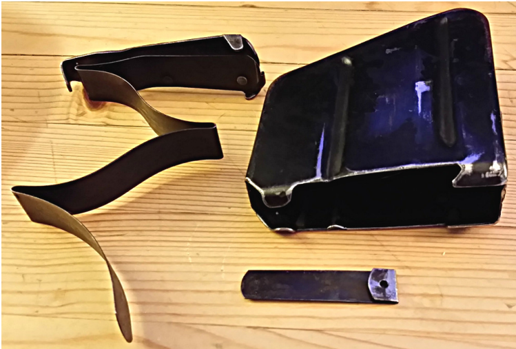
Figure 17: A stripped No.4 magazine. L: platform and spring. R: Magazine body. Bottom: auxiliary spring.

To reassemble the magazine, feed the rear of the platform in first and guide the front of it behind and underneath the front feed lips.