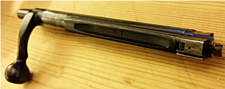
Figure 22: The bolt head is lined up perfectly with the long resistance column

Then offer up the bolt to its raceway and push it forward into the rifle until it stops. Press and hold the bolt head release catch, rotate the bolt head anticlockwise until it is flat against the bolt head release catch, and push the bolt forward an inch or so before letting go of the bolt head release catch.