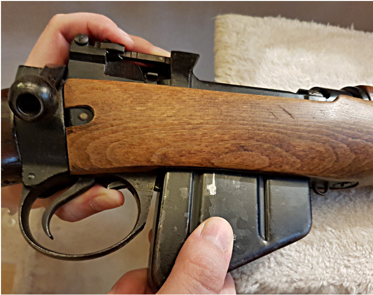
Figure 16: Removing the magazine from the No.4 rifle

The spring and platform can be removed from the magazine body by pressing down the rear of the platform and releasing the front of it from behind the front feed lips.