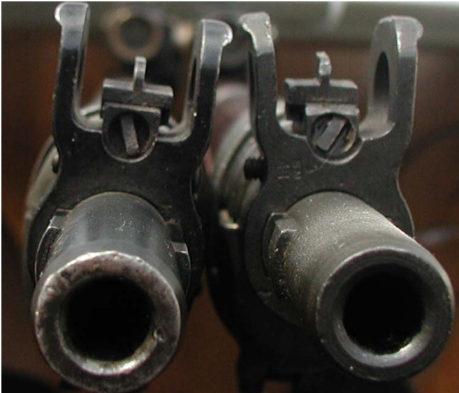
Figure 9: Closeup of early-pattern No.4 rifle foresight securing screws. Note how the screw heads are reversed, needing a special key for adjustment.

Some rifles were fitted with the Mk.3 or Mk.4 wartime rearsight, which are very imprecise and adjusted using a spring-loaded plunger and a slider. Adjustments can only be made to the pre-milled distances on the sight leaf; there are no “in-between” settings.