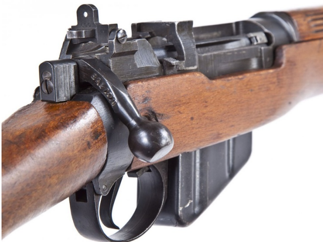
Figure 11: An early Canadian-made No.4 Mk.1 fitted with the Mk.2 two-position rearsight

distances up to 400yds. Aiming off for elevation is necessary for precise shooting with this sight.