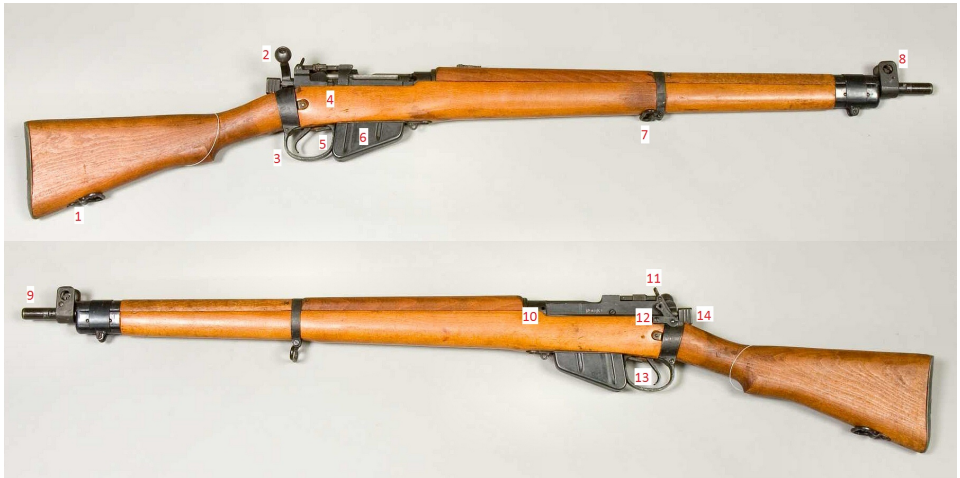
Figure 2: A No.4 Mk.I rifle with key parts numbered for reference

The parts common to all Lee Enfield rifles are shown on the No.4 rifle pictured below.