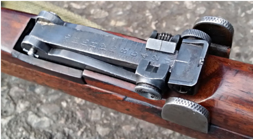
Figure 12: A SMLE Mk.III rearsight. Note windage wheel on the right hand side

The SMLE rearsight is a ramp with a slider controlled by a spring-loaded locating plunger. It can be set between 200yds and 2,000yds. The graduations on the left hand side of the ramp give 25yd intervals.