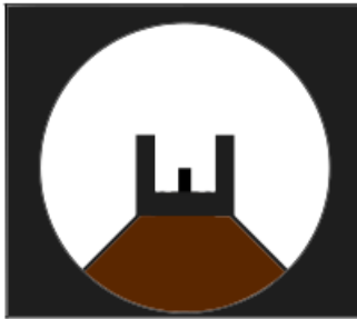
Figure 24: The No.4/No.5 sight picture (illustrative)

The rifle is fitted with an aperture rearsight and a post foresight. When looking down the sights, the firer puts the tip of the foresight in the middle of the rearsight aperture to achieve the correct sight picture. See below.