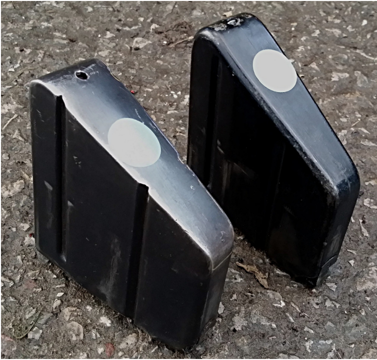
Figure 15: SMLE (L) and No.4 (R) magazines. Note the rounded edges of the No.4 magazine. The No.5 magazine (not pictured) is identical to the No.4's.

The magazine consists of the body, the leaf spring, the auxiliary spring and the platform. The leaf spring and platform are permanently pinned together and move up and down inside the body. The auxiliary spring clips to the front of the magazine body via a small pimple stamped into the body. The magazine will work perfectly without the auxiliary spring.