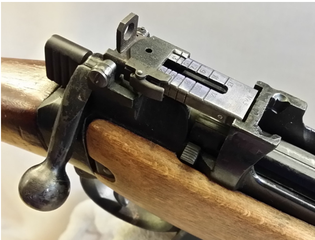
Figure 10: No.4 fitted with Mk.3 wartime economy stamped rearsight

Some rifles were fitted with the Mk.3 or Mk.4 wartime rearsight, which are very imprecise and adjusted using a spring-loaded plunger and a slider. Adjustments can only be made to the pre-milled distances on the sight leaf; there are no “in-between” settings.