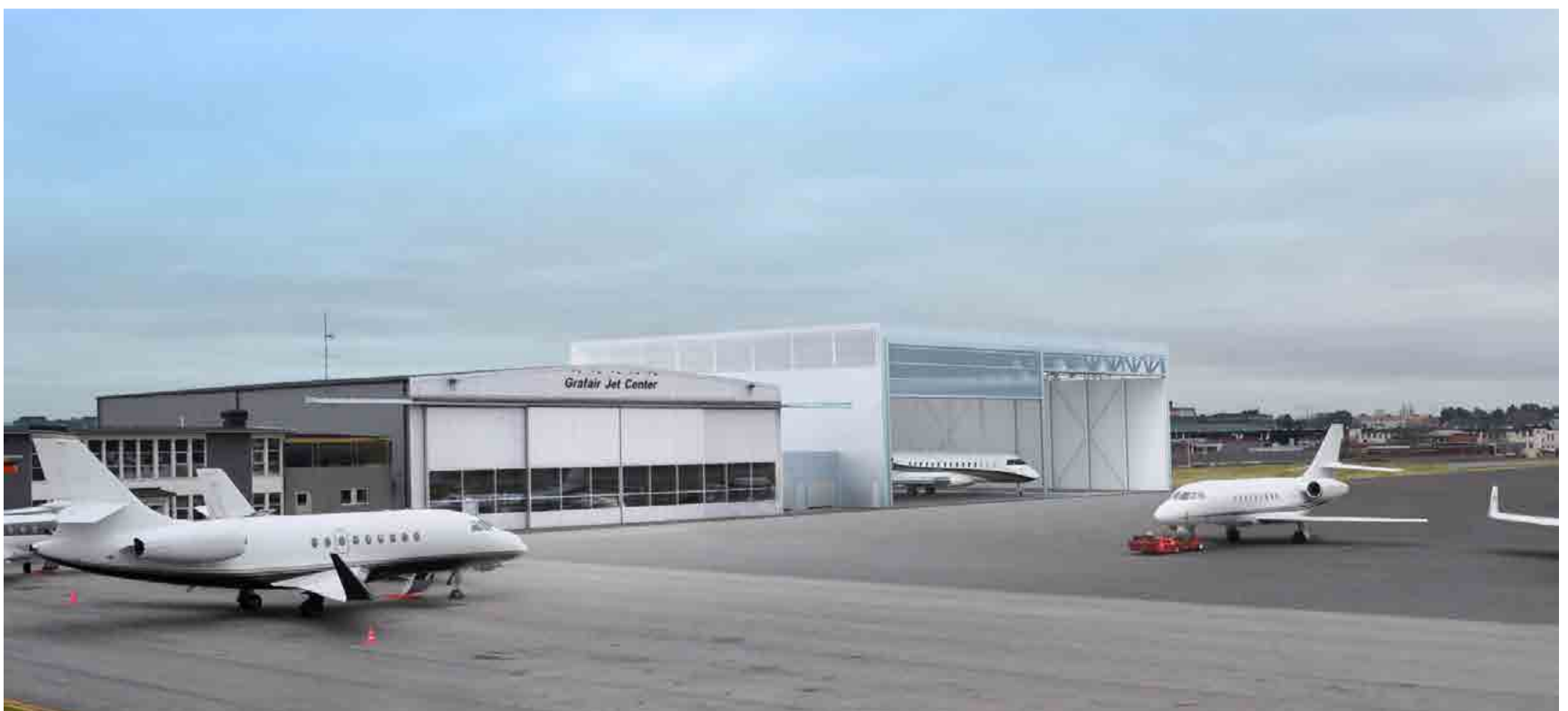
© 2018 AIN Publications. All rights reserved. For reprints go to www.ainonline.com/order-reprints