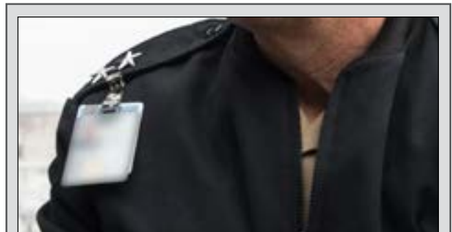
Photo security disclosure example

Photo illustrations also include images that have been retouched, filtered or are manipulated in any other way. Images that are stitched together or contain cutouts, collages, panoramas, vignetting, multiple exposures (including High Dynamic Range techniques) or any added text or graphics are considered photo illustrations. The digital movement, addition or subtraction of