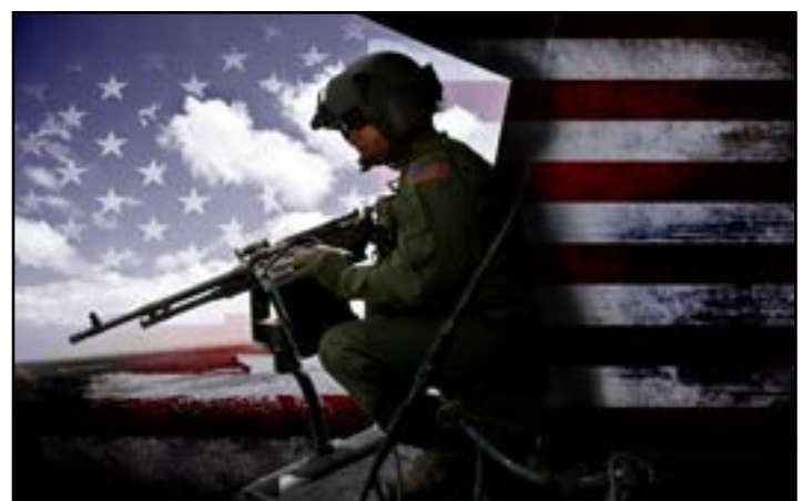
Superimposed images/changed backgrounds