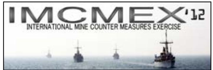
Graphics and logos (above and below)