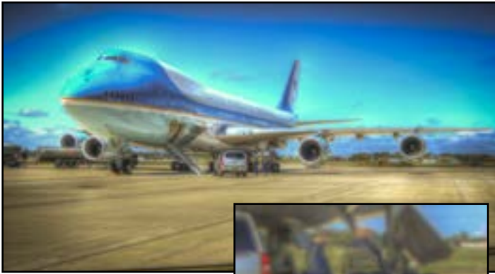
HDR or filtered images (detail shows "ghosting")