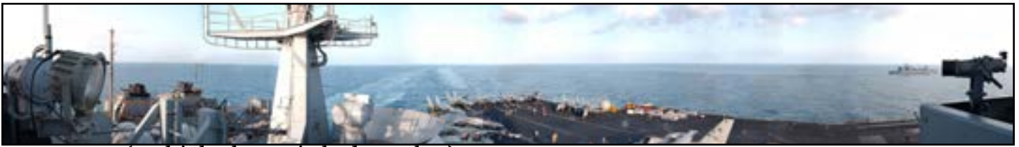
Panoramas (multiple shots stitched together)