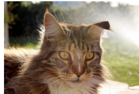
Cat with a floppy ear