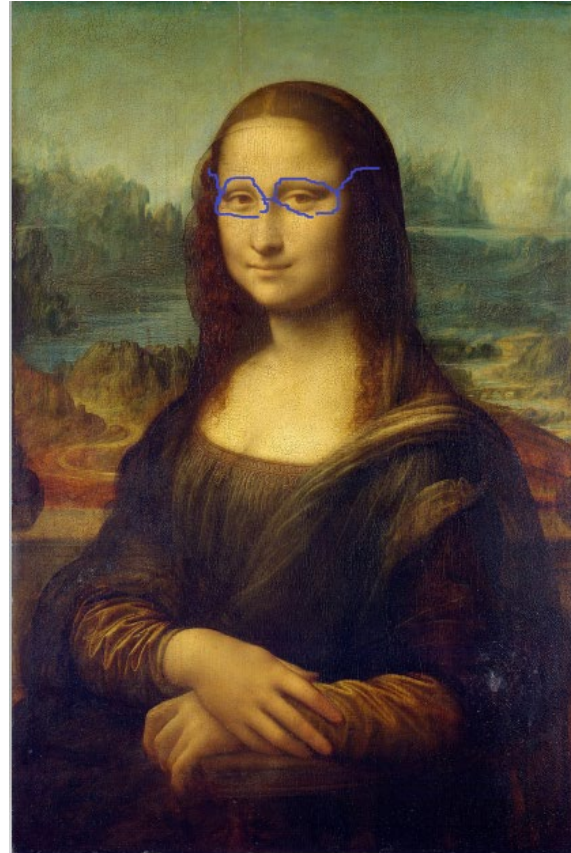
Short sighted Mona Lisa

Note. Adapted from Mona Lisa , by L. Da Vinci, c.1503-1517, Wikipedia ( https://en.wikipedia.org/wiki/Mona_Lisa ). In the Public Domain.